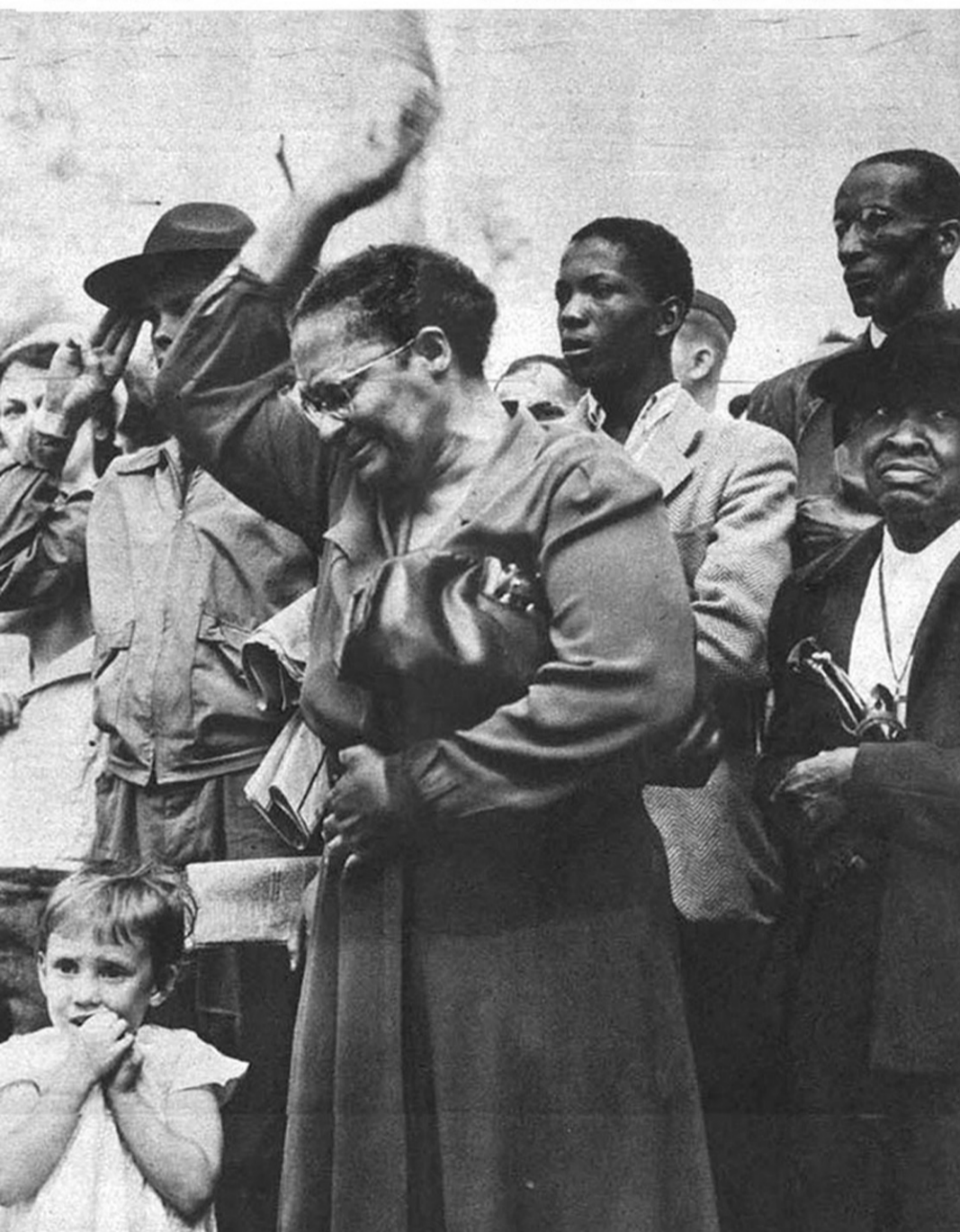
As the funeral procession arrived outside the White House grounds, the waiting crowd showed its sorrow.

The weather was sultry on this funeral day, much as it had been on April 14, 1865, the day Abraham Lincoln was shot in Ford's Theater. And in the East Room, where Lincoln had lain in state, the mourners gathered at the bier of