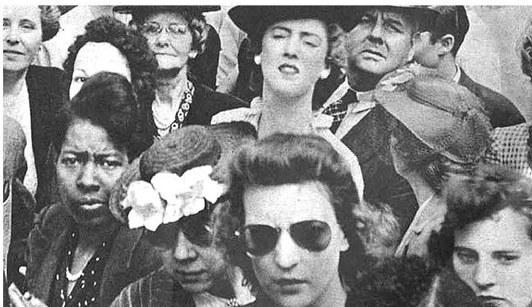
THESE AMERICANS, CROWDING AT THE WHITE HOUSE GATES WERE AMONG MILLIONS WHO GRIEVED FOR THE DEAD PRESIDENT.

In all the store windows were Yahrzeit glasses, the mourning candles that Jews light on the death of a member of the immediate family. The