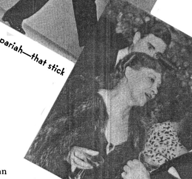
7. A social error many men are guilty of...