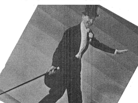
5. A social pariah—that stick