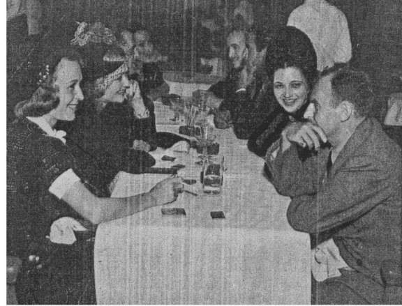
11. The informality of this scene makes it okay