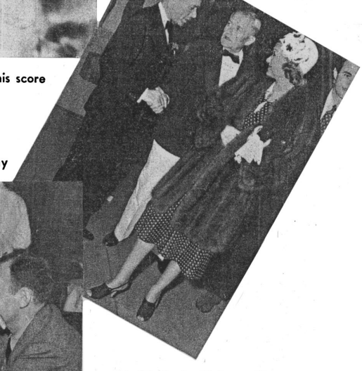
10. "Typically Hollywood"