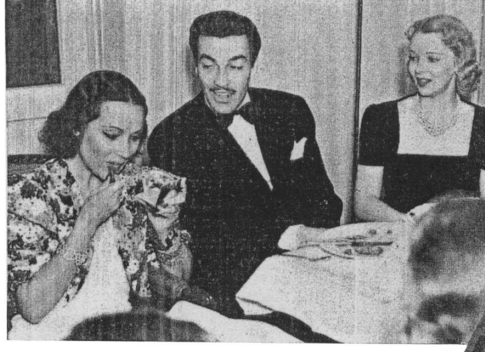
9. Too many women are censurable on this score