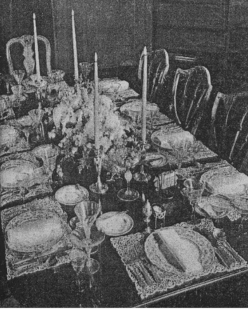
12. Wrong for a "formal table"

"Riding habits, no matter whose, both on the screen and off, are always the test of tests. There is no halfway about them: they are right or they, like spelling, are completely wrong. Anything suggesting slant pockets, or eccentric cuffs or lapels, or a pinched-in waist is taboo.