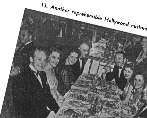
13. Another reprehensible Hollywood custom

Mrs. Post considers Constance Bennett one of the best-dressed women on the screen.