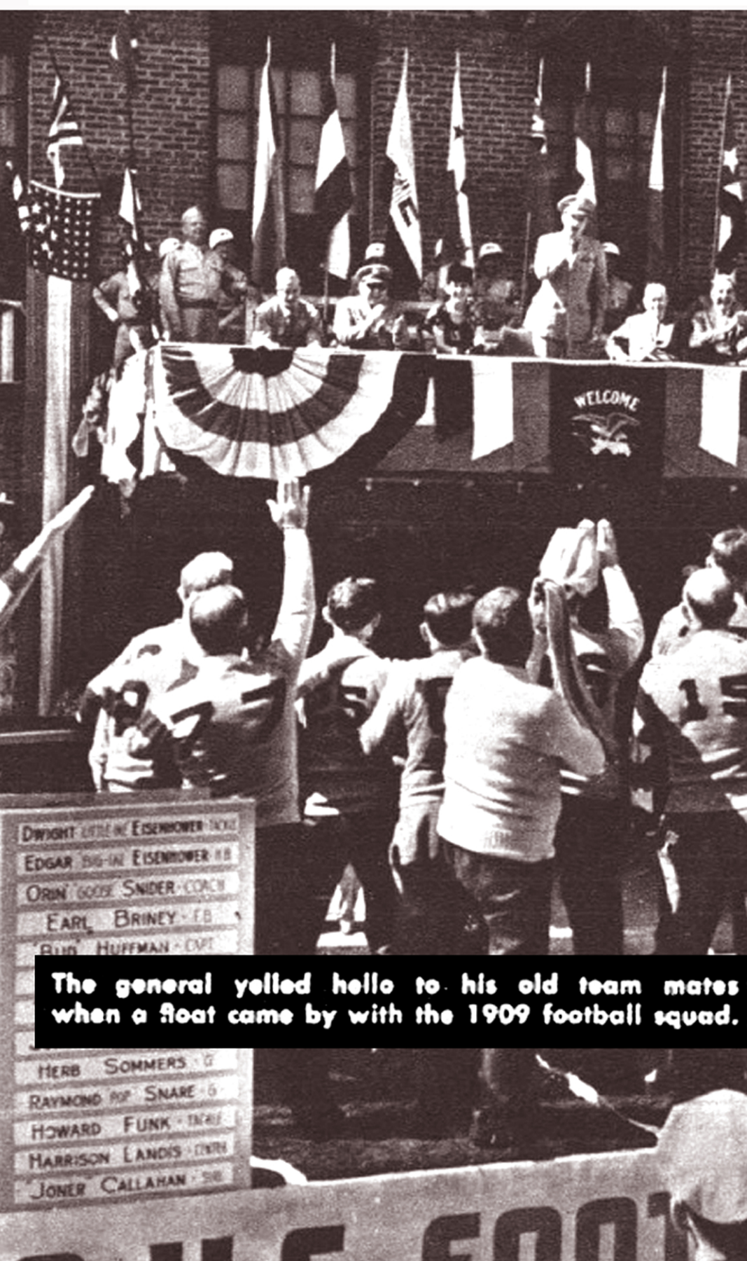
The general yelled hello to his old team mates when a float came by with the 1909 football squad.

As soon as the Eisenhower party was seated, a gun boomed and the parade began. It wasn't a military parade. It told the story of a barefoot boy's rise from fishing jaunts on nearby Mud Creek to command of the Allied expeditionary force that defeated Fascism in Western Europe. There were floats to show Ike's early school days, his high school football team, his years as a cadet