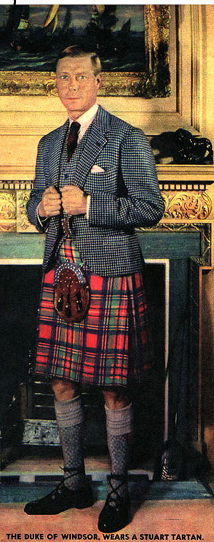
THE DUKE OF WINDSOR, WEARS A STUART TARTAN.

Why the Duke & Duchess of Windsor Want to Escape to the United States