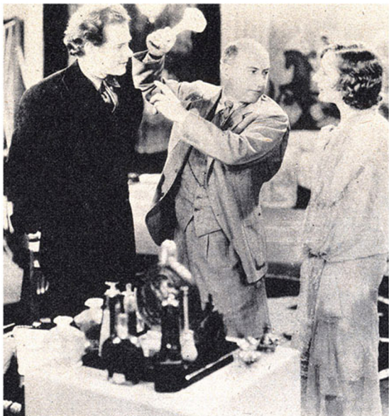
CHARLIE BICKFORD and Kay Johnson were directed by DeMille in his first sound film, "Dynamite." He showed Charlie how to hit Kay.

C.B.'s father was an actor and playwright, and later a partner of David Belasco. His mother was an actress, and later a very successful play agent. DeMille was born in Ashfield, Mass., on August 12, 1881. His father had made a name for himself in the theatre, but not too much money. When the elder DeMille died, his widow turned her home into a school for girls. Income from this venture made it possible for Cecil to go to