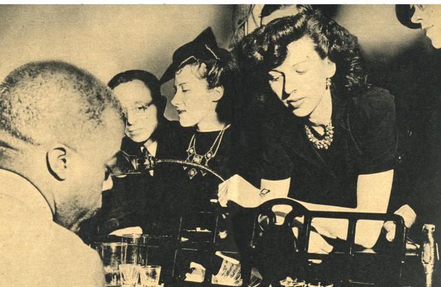
THE BOOGIE-WOOGIE ARTIST "SENDING" JAZZ DEVOTEES AT HOT JAM SESSION IN VILLAGE VANGUARD, NEW YORK'S BOHEMIAN NITERLY.

"Back Door Stuff" was first written for the Chicago Bee in 1932, where Dan served from 1932 to 1937. The fame of the column induced the publishers of the Amsterdam News to bring