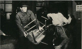
ONE SURE-FIRE INGREDIENT IN EVERY WAYNE FILM IS A FIGHT.

erns, later gave him his first big break in the 1938 hit, Stagecoach .