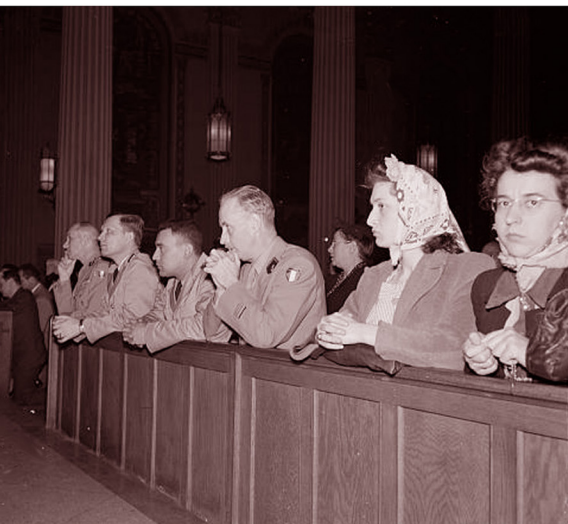
D-Day services at Saint Vincent De Paul Church. New York City

Subdued Home Front Sees Invasion as Hazardous Launching, Not as Celebration Signal