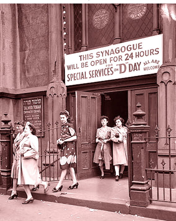
D-Day Synagogue Services, June 6, 1944

On the evening of D Day, President Roosevelt led a radio audience estimated at 100,000,000 in a prayer of his own composing: "Our sons, pride of our nation, this day have set upon a mighty endeavor . . . Lead them straight and true . . . Their road will be long and hard . . . Some will never return. Embrace these, Father, and receive them."