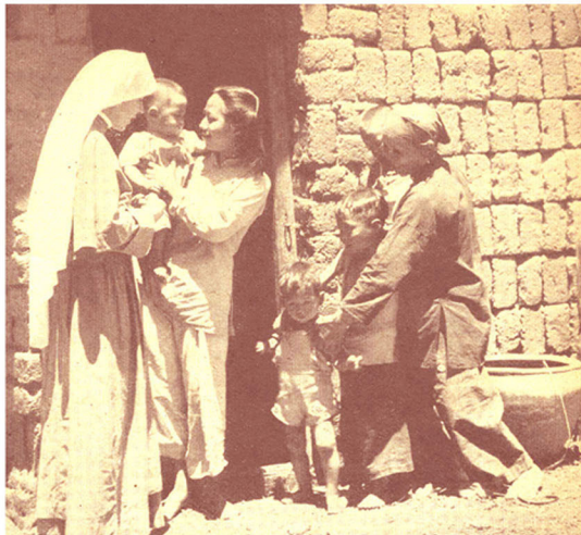
Before the Reds came. Poor Chinese families welcomed the ministering nuns.