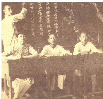
Mercy. A starving waif saved by the Maryknoll Sisters and a deaf-and-dumb class at the China Inland Mission in happier days.