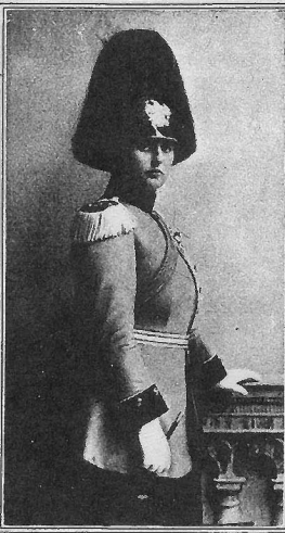
The Princess August William of Prussia, Col. of the Fourteenth Dragoons