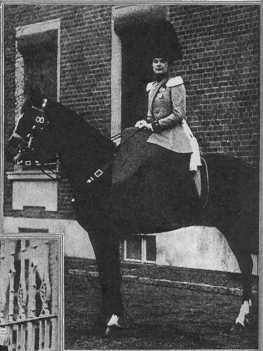
The Crown Princess Cecile of Germany, Col. of the Second Prussian Dragoons