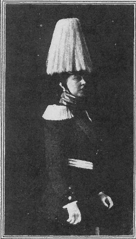
Queen Sophia of Greece, until the war, Col. of Prussian Grenadier Guards