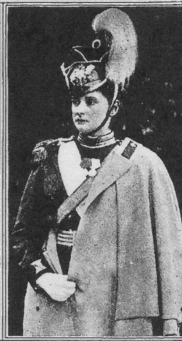
The Czarina, who is a Colonel in no less than four Russian Regiments