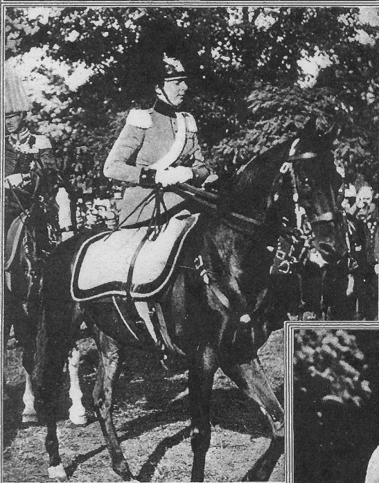
Princess Eitel Frederick, wife of the Kaiser's second son, Col. Prussian Dragoons