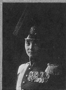
Grand Duchess of Mecklenburg-Schwerin, Col. of the Mecklenburg Dragoons and Imperial House Guards