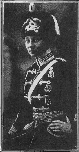
The Duchess of Brunswick, the only daughter of the Kaiser, Col. of the Death's Head Hussars