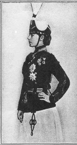
The Crown Princess of Roumania, Col. of the Fourth Roumanian Hussars