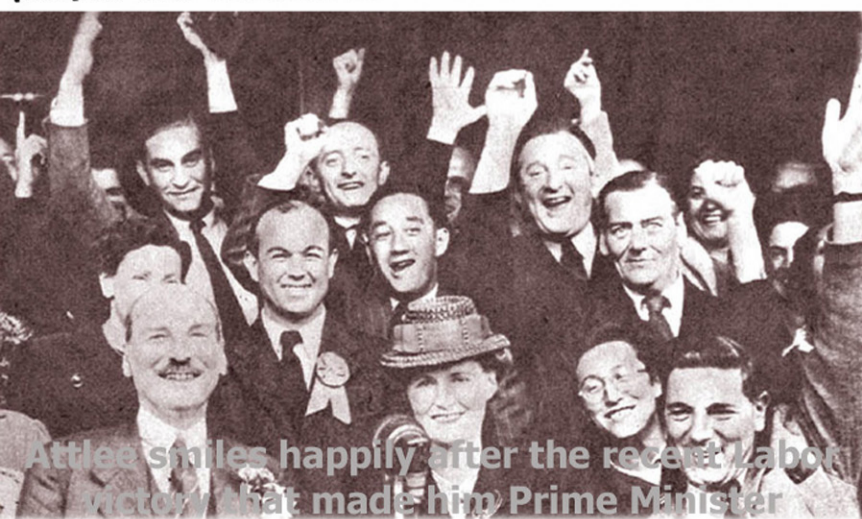
Attlee smiles happily after the recent Labor victory that made him Prime Minister

Nobody was more surprised at the explosive 1945 election than the winners. Whatever success the Labor Government may have in reconstructing Britain, there is no doubt that the people are behind it.