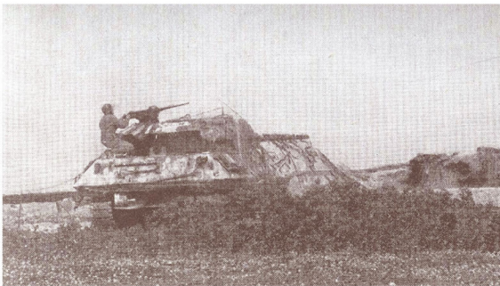
The soldier pictured above is perched precariously atop a camouflaged American tank, shooting at German dive bombers and low-flying strafing planes