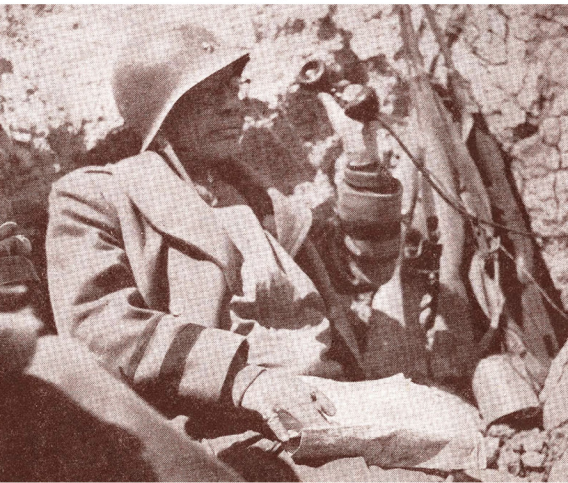
Here is Brigadier General Theodore Roosevelt, who always turns up in the hottest spots, posing for Collier's photographer in an advanced infantry command post

An American gun crew, awaiting orders, kills time with a card game, while one man, with headphones, keeps in touch with the command post. The game they're playing wasn't identified (could be blackjack)