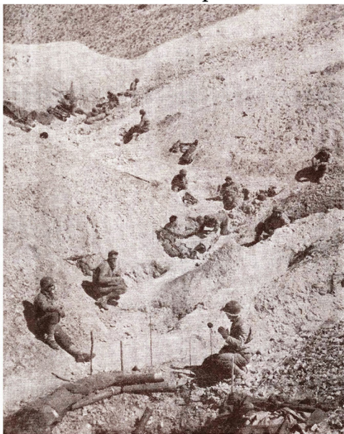
American soldiers here shown find shelter in a ravine from dive bombers and German artillery fire. They are scattered to minimize losses in case of a hit