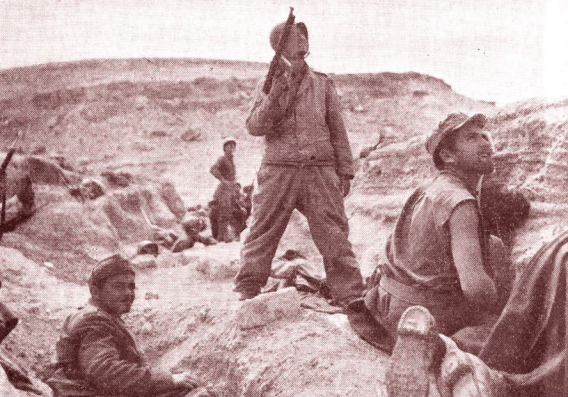
Italian prisoners frequently had to crouch in shallow ravines when their own planes came over. The American soldier with the tommy gun hopes that the plane will fly low enough to give him a fair shot