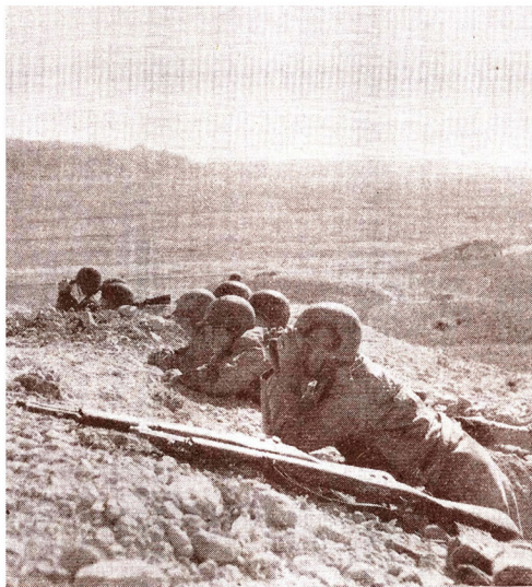
Half a dozen soldiers of an American patrol crouch behind a ridge on the road to Maknassy while their commander scans the desert for sign of the enemy