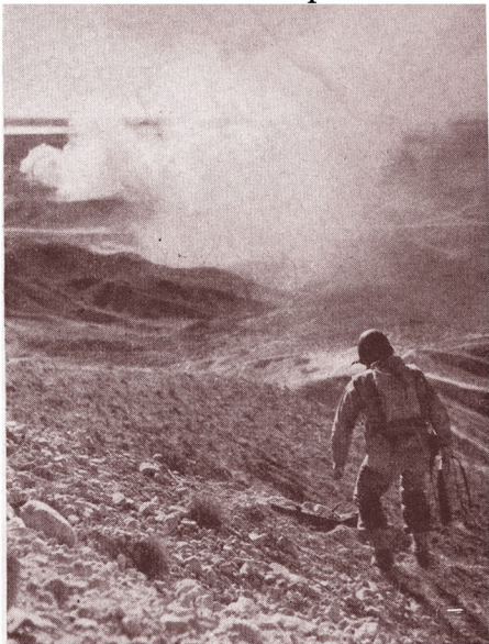
Discovering the screaming death dropped by Stukas, an American soldier moves calmly across the battlefield to his command post