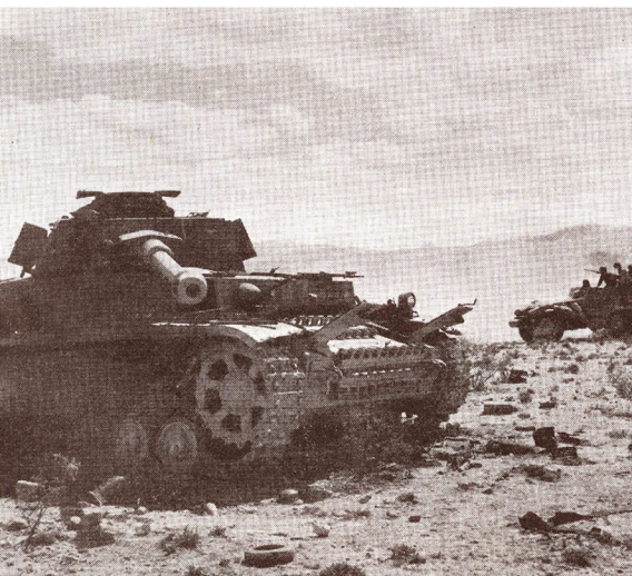
Past ruins of a tank, with a mounted 88-mm. gun hit by our fire, an American half-track loaded with soldiers moves up to the line