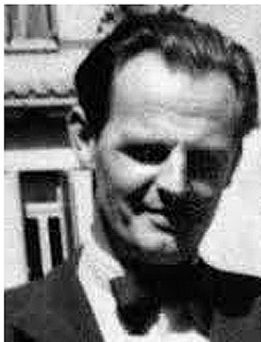
Donald D. MacLean

Background: The disappearance of two British foreign service men, D. D. MacLean and Guy Burgess, upset the State Dept. Both men had access to confidential U. S.-British diplomatic files, although not to top secrets. Even if they hadn't gone over to Russia, their mysterious disappearance on a "holiday" shook official U. S. confidence in their eligibility to handle high policy papers of the two Allies.