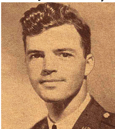
Capt. Colin Kelly Jr.