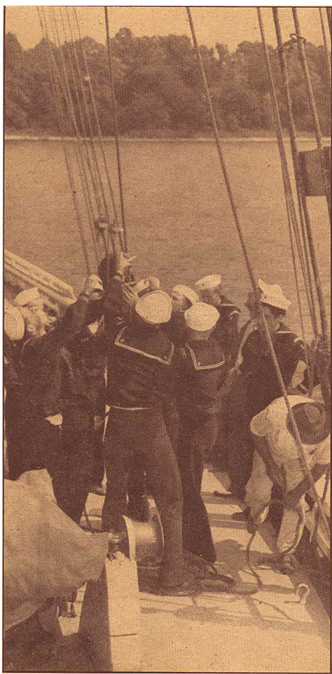
ON LAND OR SEA. Scouts are at home anywhere. Sea Scouts are older boys, get to know the fundamentals of navigation.