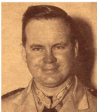
Comdr. John D. Bulkeley