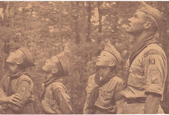
BACK TO NATURE. Woodcraft still is a cardinal part of Scouting. Under Scoutmasters well-versed in the lore, boys learn the secrets of woodlands and their inhabitants.