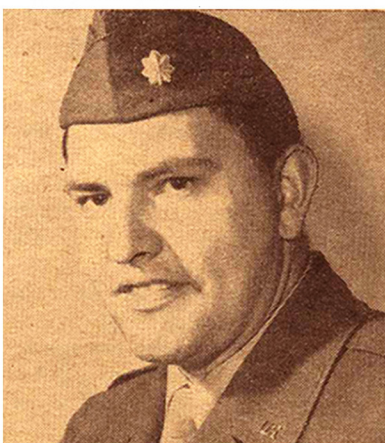
Dr. Paul A. Siple