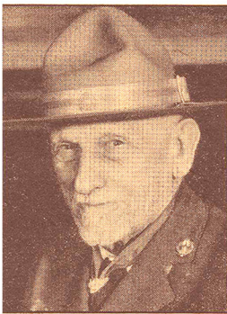
Dan Beard, Scouting immortal