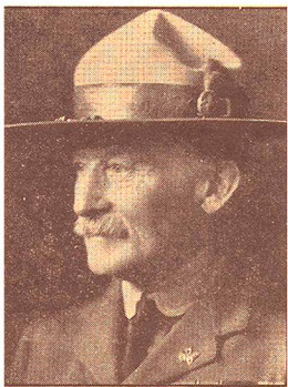
Baden-Powell, Scout founder

once he knew that he had his life work cut out for him. He studied what boys were doing all over the world. He found that in the U.S. Dan Beard had formed the "Boy Pioneers," Ernest Thompson Seton "The Woodcraft Indians."