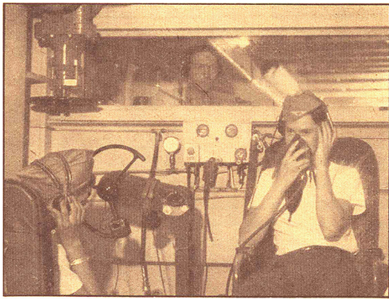
THE AIR, TOO. The aviation age opens new fields for Scouts to conquer. These Air Scouts check Wright Field high altitude equipment.

The Boy Scouts have a right to be proud. ●