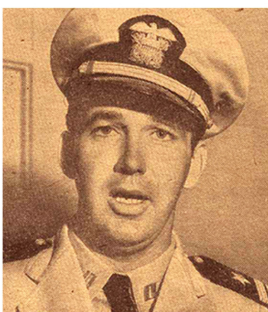
Lt. Edward H. O'Hare