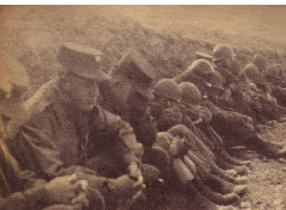
The men participating in the test sat in an open trench with their backs toward ground zero as the big flash whitens sky. Trench is 3500 yards from the zero spot.

This awesome scenery I learned, was the results of a previous A-bomb test, and even as I stared I saw a Sherman tank collapse suddenly in a pile of rubble as one of the supports keeping it standing gave away. The clatter sounded like a pile of scrap metal being moved. It was then I felt the probing finger of fear in my vitals. The classroom was too far removed from the actual scene and during instruction I would find my thoughts wandering often. But here I knew this would never occur.