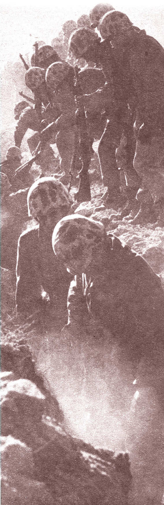
Infantrymen dropped into the trenches preparatory to setting off of A-Bomb.

In the beginning there was none of this excitement. In fact I felt rather detached when I was informed I was to be included in the personnel observing a Nevada Test Site atomic explosion. My job was to assist in testing radiological safety gear and procedures for decontamination. Before leaving my base I'd had to bone up on procedure and attended daily lectures and advanced instruction until my head was swimming.