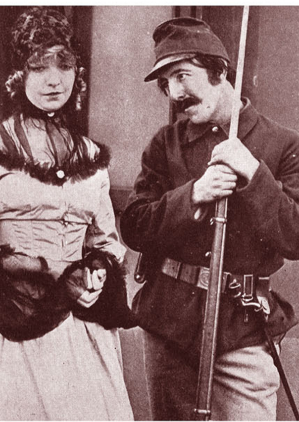
Lillian Gish, the unidentified extra and the celebrated wistful glance. Although the fans clamored for his name, the soldier in this famous still has always remained unknown.

As nothing like a twelve-reel film had ever been attempted before, he naturally met with opposition on all sides. When the so-called business men of the picture industry, believing him to be an impractical dreamer, refused him financial aid, he went begging to the merchants of Los Angeles for a thousand dollars here, five thousand there, another two thousand from someone else.