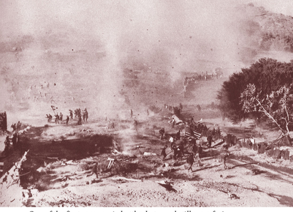
One of the first panoramic battle shots, and still one of the greatest.

When the story was ready to go before the camera, the older players who were to play the parts on the screen came forward and acted the parts they had been watching us re-