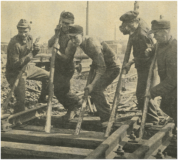
Heave-Ho. German workers repair rails,