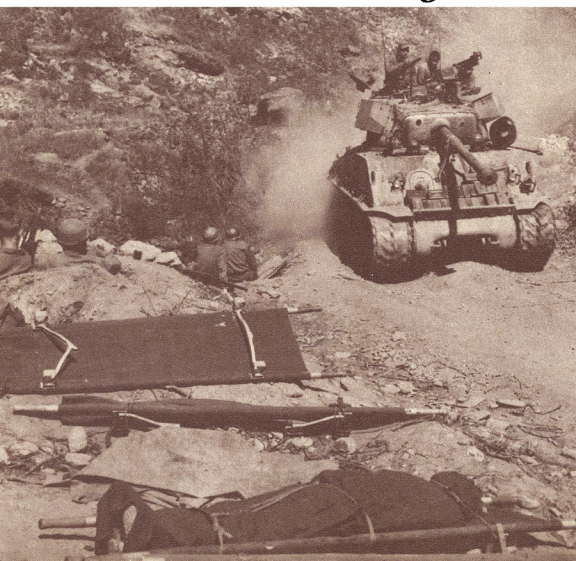
An American tank rumbles down a road on Heartbreak Ridge, passing a machine-gun position and litters for dead and wounded.

southern end of Heartbreak Ridge, and a battalion of the 9th Regiment was able to take the southernmost peak with only four casualties.