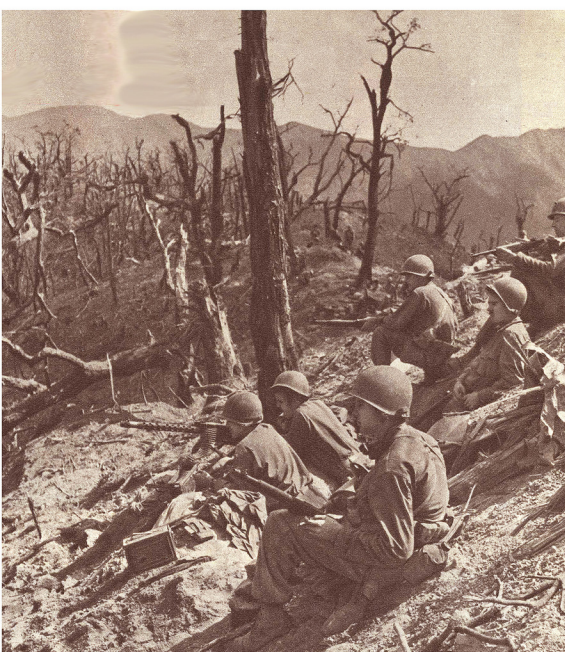
Victorious Americans poised to defend the hills they captured after a month-long struggle

T HE tired, unshaven major looked up at the chaplain and grinned ruefully. "They're taking a beating, Father," he said. "They're giving a beating, too, but not many men are left."