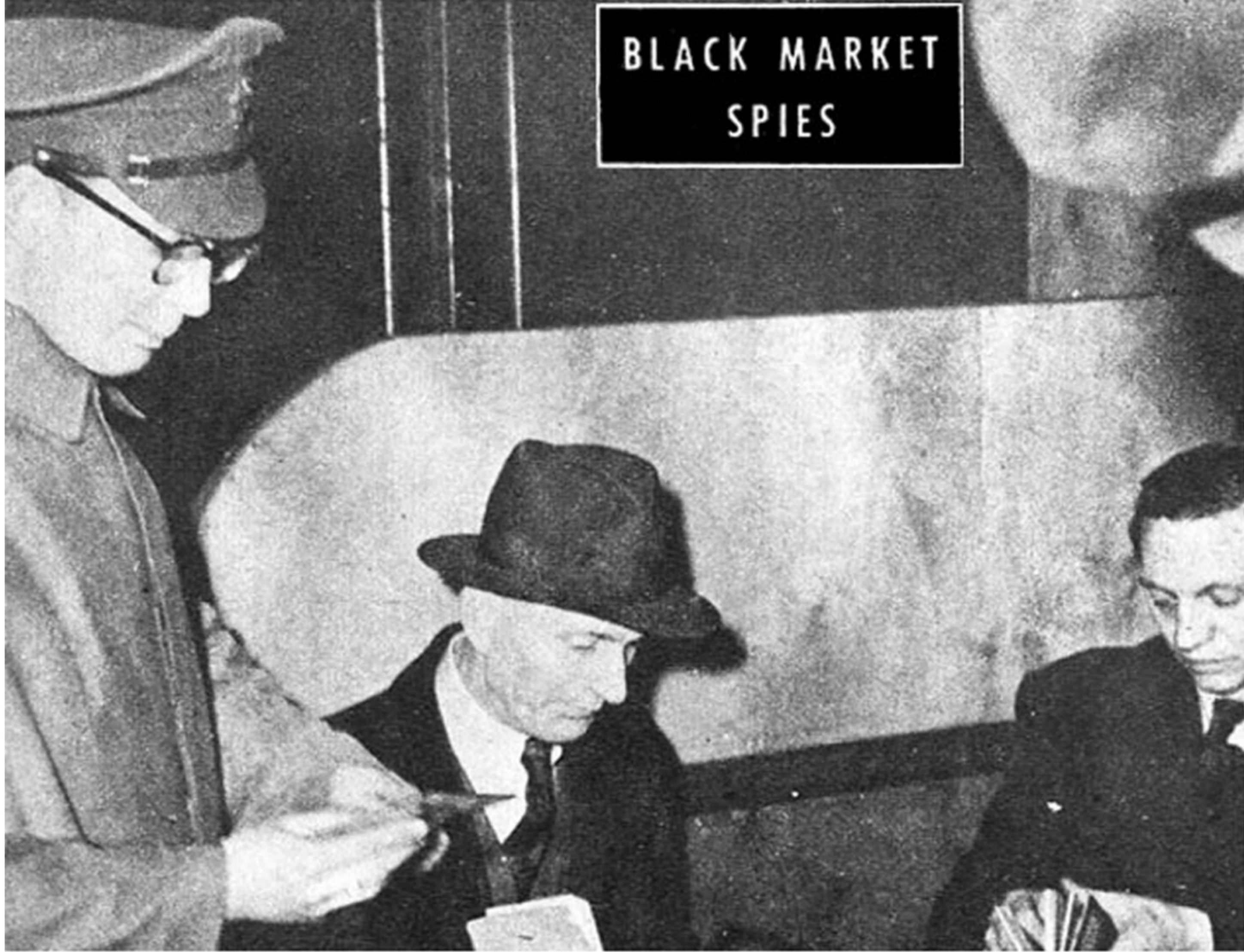
British MP catches operatives peddling papers in Berlin bar frequented by black marketeers of post-war espionage. Man in center paid 3,000 marks for documents.

Among the most successful big-time operators is a student from Chicago who went to Berlin to work his way through college. He now has a miniature castle in Zehlendorf, a chauffeur-driven car with ample supplies of black market gasoline, a butler, two Rembrandts. The one thing he hasn't got is the college degree he went to Berlin for.