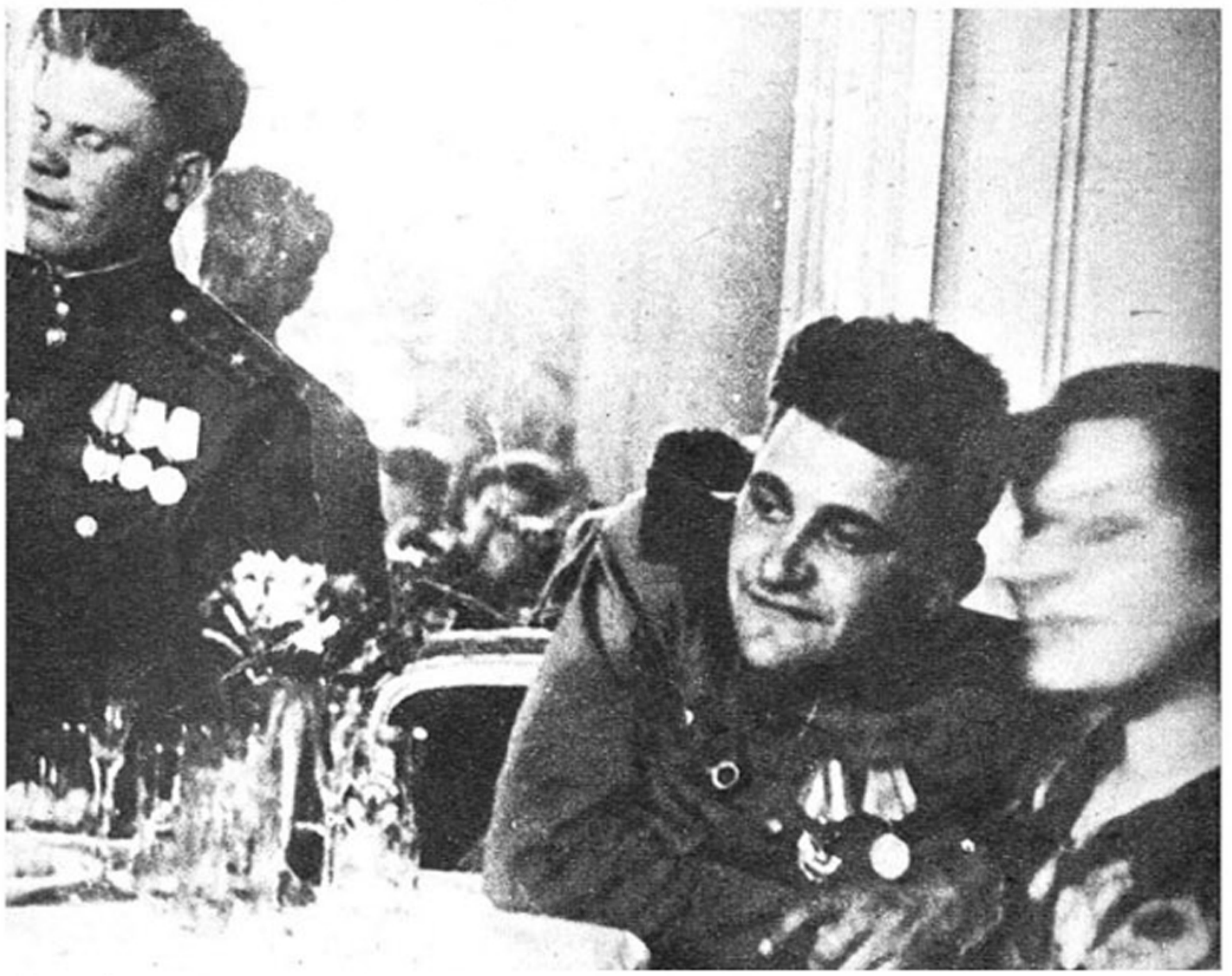
Landid camera in Berlin's swanky Cafe Femina, clearing house of spy secrets, catches Russian officers, blurs girl operative who moved to escape identification.