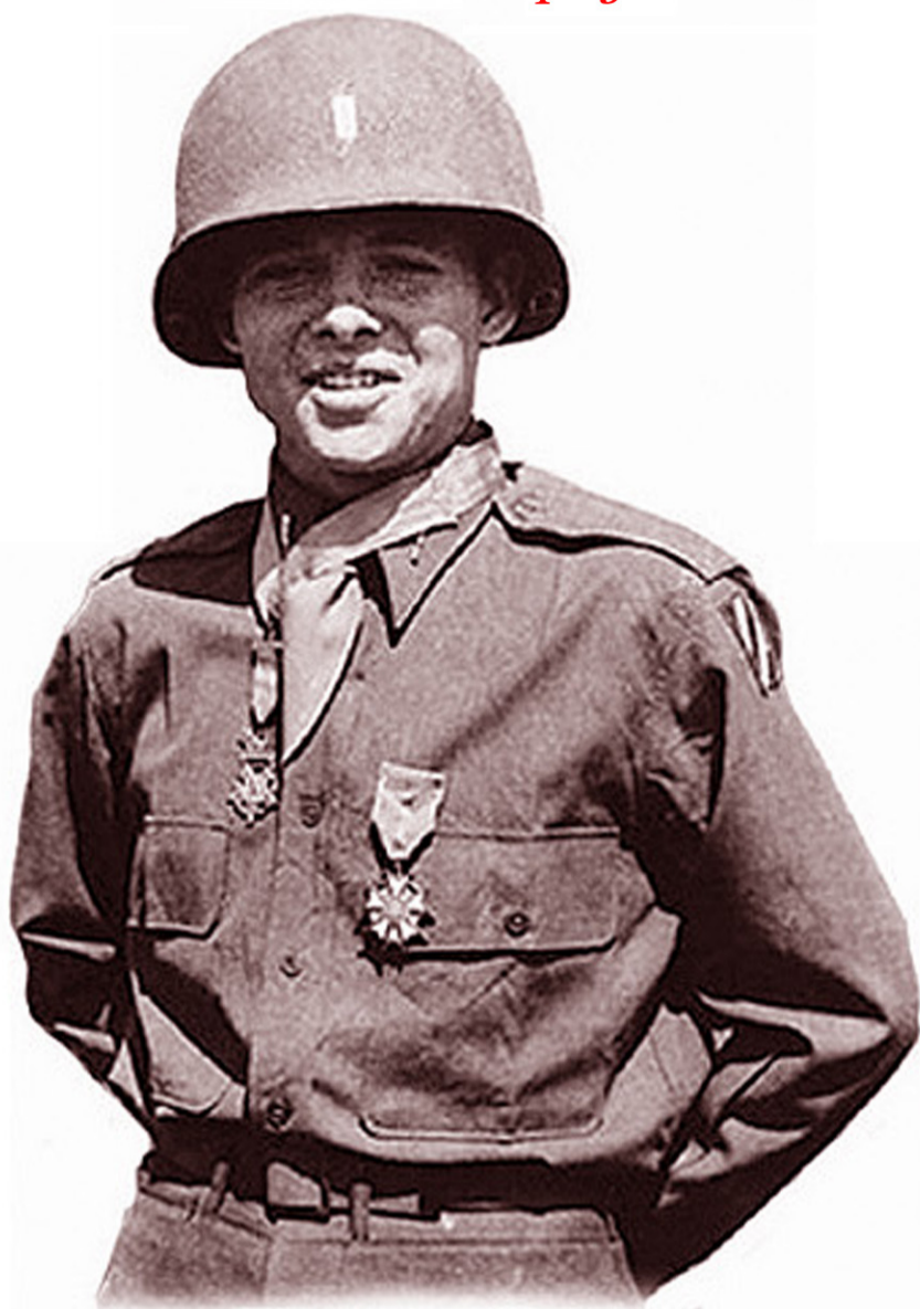
1945: awarded Medal of Honor.