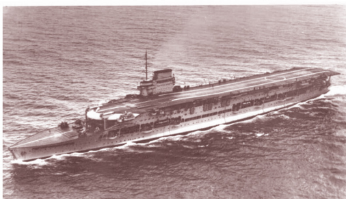
More Planes and More Carriers Like "Courageous" Are Planned By Britain

T O EASE the strain on Nazi military necks by a total of about 300 tons, German soldiers are now discarding old-style helmets for new ones half a pound lighter.