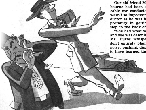
"I do not care for the suits that you call zoot," said the Egyptian, "or for those very loud, flashy ties."

"Everybody seems to be so assertive," he said. "The sirens at night keep me awake. They would seem to mean that there is an air raid, but no, it is just some motorcycle policemen escorting a conference figure through town."