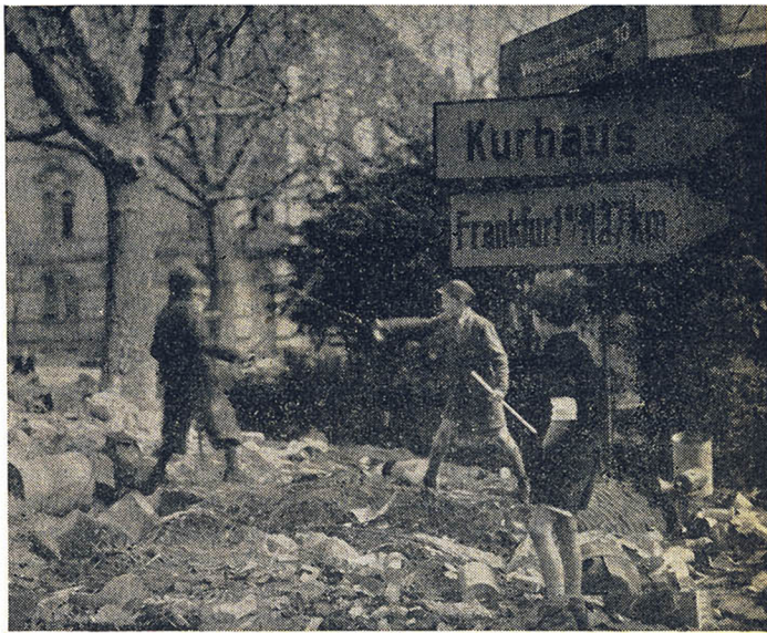
BOYS PLAY WITH NAZI SWORDS

... life for the German is bleak—for his conquerors, perplexing