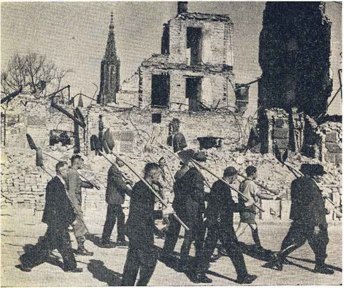
NAZIS WORK WITH SHOVELS