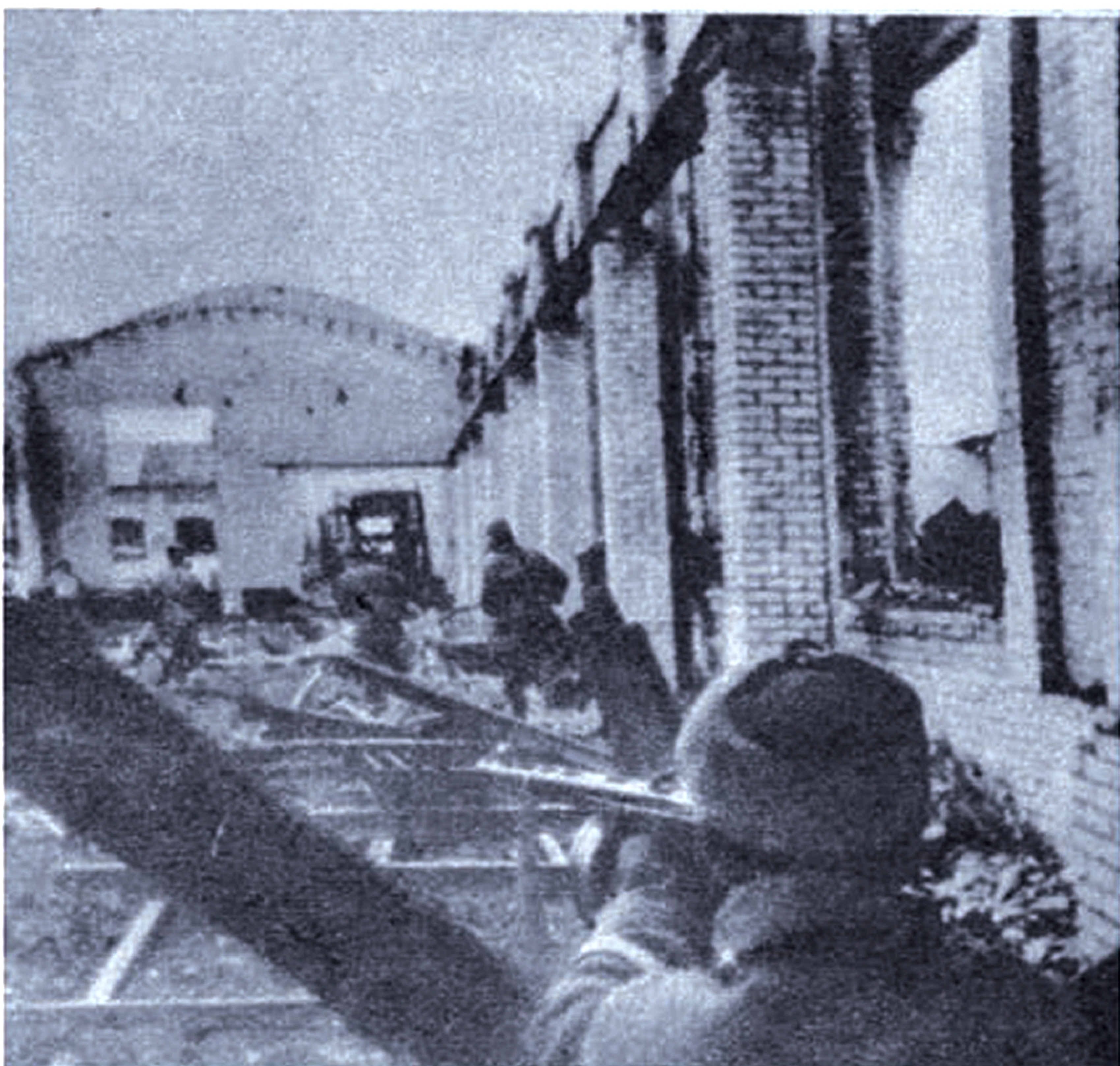
RIGHT, U.S. ARMOR AND G.I. MOVING THROUGH AACHEN; ABOVE, THE RUSSIANS DID IT IN STALINGRAD.