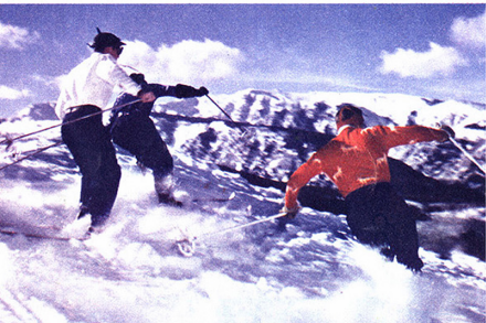
Deep powder-snow skiing on a slope of Ajax Mountain.

Throughout the winter, Pfeifer and his assistants explored the surrounding territory, cutting new trails and open slopes and enlarging the old ones. Miners and ski troopers worked side by side in the town and up on the mountains. A bulldozer reamed out old mining roads to form a network of connecting trails and runs. Early that spring came the climax of the effort. Up Aspen Mountains, at a cost of $250,000 was flung the longest ski chair lift in the world, extending three miles into the mountains.