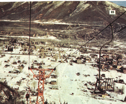
Aspen, from a distance, with its $250,000 chair lift in the foreground. The little village is ringed by peaks, seven of which rise more than 14,000 feet

Here on winter evenings the booted, wind-burned skiers predominate. Behind the swinging doors in the back room and in the overheated, faintly steamy atmosphere up front, they crowd around scarred dark tables laden with steak platters and huge steins of beer, their cigarette smoke beclouding the already dim light from the old Victorian chandeliers. Feet planted firmly on the bar rail, they scan the faded photographs of prize