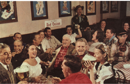
Night life in Aspen, where the Red Onion bar is a favorite meeting place for skiers, miners and townfolk. Credit it to skiing, which has remade the town

A SPEN is a tiny Colorado village tucked away in one corner of a lush green valley ringed by snowcapped peaks rising to altitudes of more than 14,000 feet. It is an old mining community in the midst of a turbulent transformation engineered by ex-G.I.s, ex-Wacs, artists, musicians, small businessmen and a wealthy Chicago industrialist.