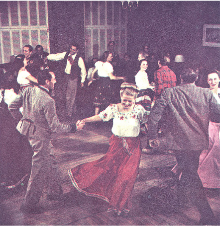
Square dancing in the Blue Room of the Hotel Jerome, center of the town's activities. The Jerome was built in 1889, nine years after Indians began to leave

fighters in long tights that adorn one wall and study the bunches of dried red onions flanking the mirror. Their talk, the mysterious jargon of the Schuss , Telemark and stem Christie, waxes fast and furious.