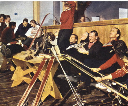
The Sundeck, at the summit of the 3-mile-long chair lift, the longest in the world