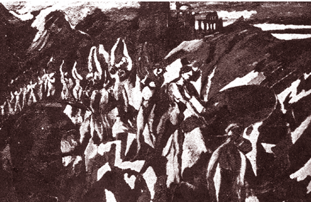
"The War Barrel of the Danaids," by David Burliuk, showing a procession of mothers winding across the mountain to deposit their children in the great maw

"Well," he said, "I think the style of modern Russian painting developed from a study of French painting—western ideas from the year 900 onward carried over to Russian soil. Then, too, it has come from a close study of the art of China and Japan, and from our love for the Russian people and its own olden art—the ikon , the cheap engravings, and the decorations on our wooden utensils. The study of street signs has contributed, also. The new painting still shocks the artistic bourgeoisie, but its influence on life is already immense."