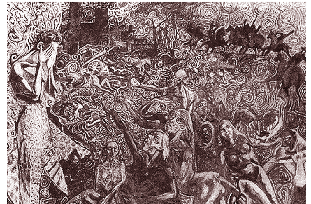
"The Angel of Peace Who Came Too Late," masterpiece and to-day, done in smouldering reds and dull blues—a terrifying symbolic of Russia