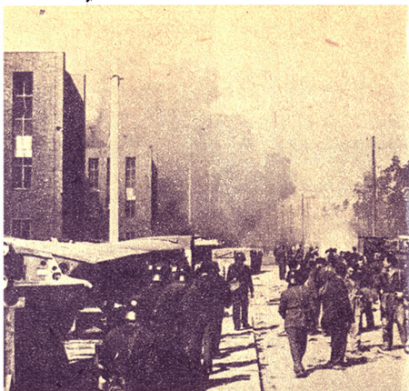
The works were heavily bombed during the last war and were 60 per cent destroyed.

As more cars were sold abroad, foreign countries introduced new restrictions on imports. Nordhoff countered by setting up assembly plants in Ireland, South Africa, Belgium, Brazil, Australia, and New Zealand. With a third production line coming into operation at Wolfsburg, his immediate target is over 1,000 cars a day.