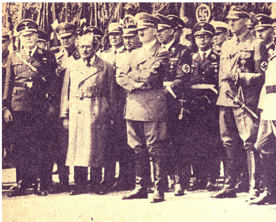
Hitler stands next to Prof. Porsche who designed Volkswagen, later built sports cars.

There was still a sellers' market, and Nordhoff brought the pressure of consumer demand into psychological play in the works. Every finished car was delivered immedi-