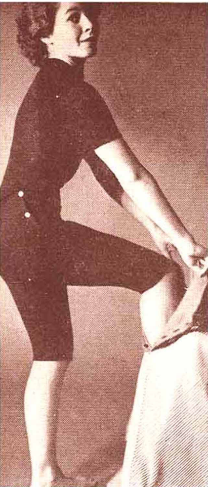
Rhinestone-buttoned leotard (Masket)