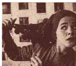
Corsican cap (Madcaps)