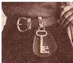
belt (Roar Van S)