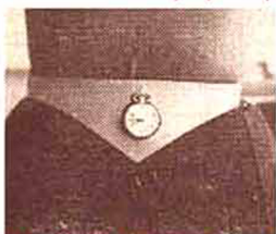
Watch belt (Frank Speyer),