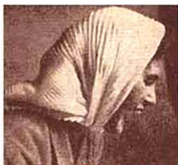
Head scarf (Symphony),