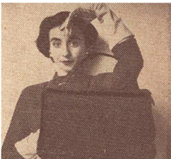
Hands in a fur handbag