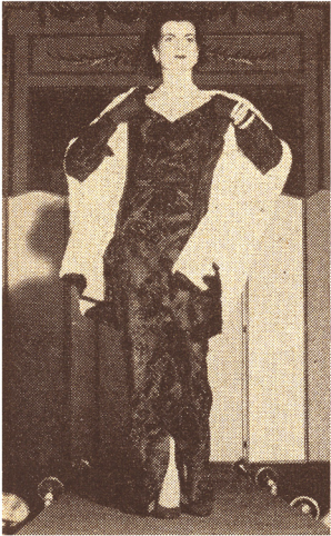
Russian broadtail dress; cape that reverses to ermine.