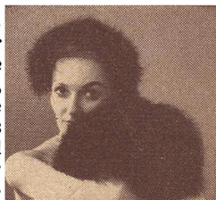
Fox evening hat and muff

Home-grown chinchilla (said to be finer than the Andean type and not nearly so costly) made one of the wonderfully "wrappy" new little furs ( r. ), especially supple because the skins were set on black lace (Esther Dorothy).