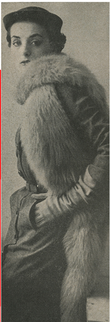
Yards and yards of pale beige fox stole ending in fox tails