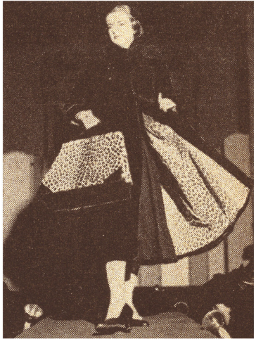
Sealskin coat, leopard-print silk lining, leopard satchel.

● Show-piece de luxe: Little Red Riding Hood in ermine cape with a ruffle of ermine tails.