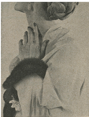
Mink-dyed squirrel forms cuff ends to pink chiffon stole.

FUR JEWELRY is a warm touch for winter. Miniature fur pieces become necklaces, lapel pins, earrings — decked out with glitter gems. Fashion-wise Anita Colby ( opp. p. ), excerpts from whose forthcoming Beauty Book are in the current LOOK, wears a jewel-clasped pale mink necklace (Vogue Jewelry, about $45). . . . Other fur gems ( r. ): Ermine-head lapel clip (Kramer Jewelry, about $20); rhinestone collar with ermine tails (Walter Lampl, about $25); rhinestone - ringed, mink-tail choker (Annis, about $7.50, below ).