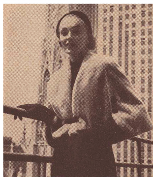
Belted nutria, Ritter Brothers

NO MORE WOLVES IN SHEEP'S CLOTHING. As a result of the new Fur Products Labeling Act, furs in the shops now had the animal's identity plainly marked on a big ticket. Example: "Blue River Otter; country of origin, Canada," at fashionable furrier Maximilian. Further news: Full-length "stable sable" (domestic) coats, promoted by Ritter for all-around wear. Short fur jackets ( above ) and capes ( below ) became suddenly important for fall, trimmed like suits . . . and full-length fur coats were pleated like cloth—releasing a gradual fullness climaxing in the tulip line ( opp. p. ).