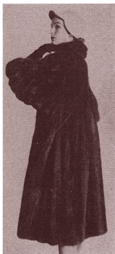
Side pleats for gradual flare; ranch mink (Ritter)