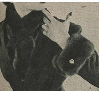
Detachable from suit: mink-dyed squirrel ascot, cuffs

FURTHER EVIDENCE of the importance of the Italian couture ( QUICK , Aug. 13) was noted when the giant U. S. fabric firm, Cohama, sent its stylist to Italy. Result: A New York City fashion show of 35 resort costumes in Cohama fabrics by leading Italian designers.