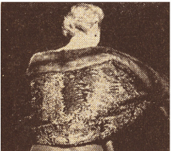
● Reversible mink and Russian broadtail cape-stole.