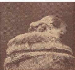
Chinchilla on black lace