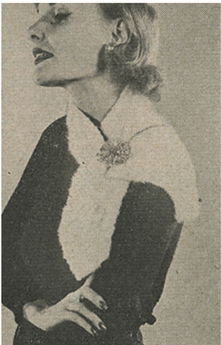
Pieced white mink furrykin fits working girl budgets.