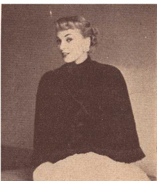
Fringed seal from Fredrica