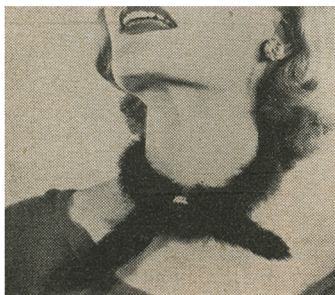
A jeweled "minklet" that any girl can accept