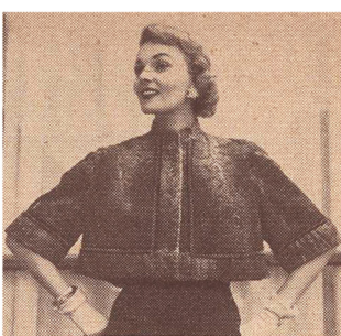
Ornamental pockets, Furbelows