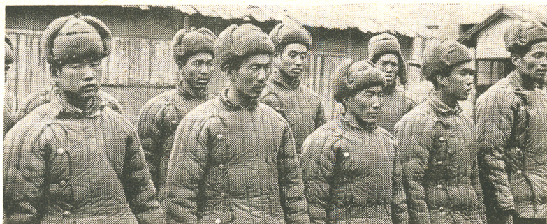
Caught in Korea: Chinese Communist prisoners in U.N. stockade.

Threats of a general war in the Far East grew as perhaps 250,000 Chinese Communists jumped into the battle for Northwest Korea;