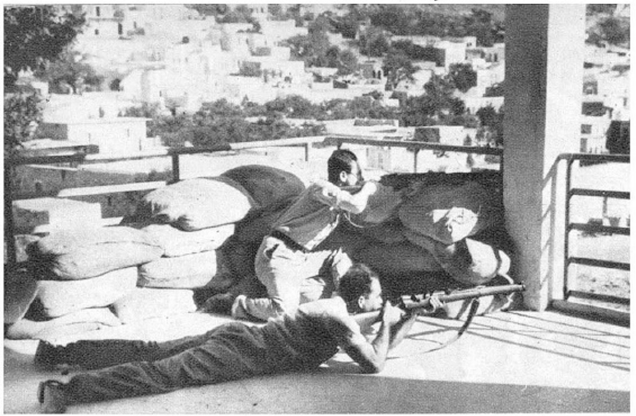
Palestine is the scene of almost constant clashes between Arabs and Jews. Here Jews answer Arab rifle fire in the town of Safad, one of the country's hottest spots

Whether or not the Balfour Declaration legally permits unlimited Jewish immigration is another matter. Any good Zionist lawyer can find words in Balfour's historic paragraph to mean yes, and his Arab counterpart can find some to mean no. Until some legal genius comes along with a solution, the problem remains and the conflict continues.