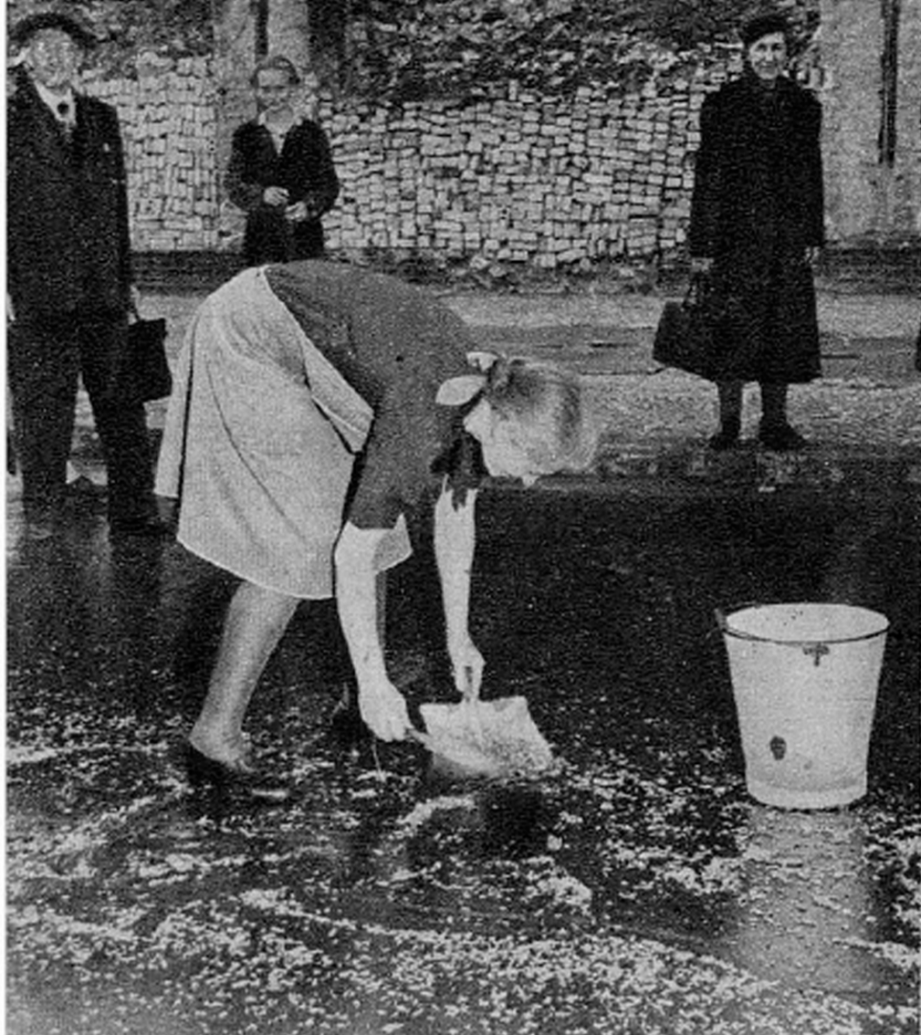
A hungry hausfrau picks up oats dropped from a passing Russian vehicle. She will grind them into a rough flour.