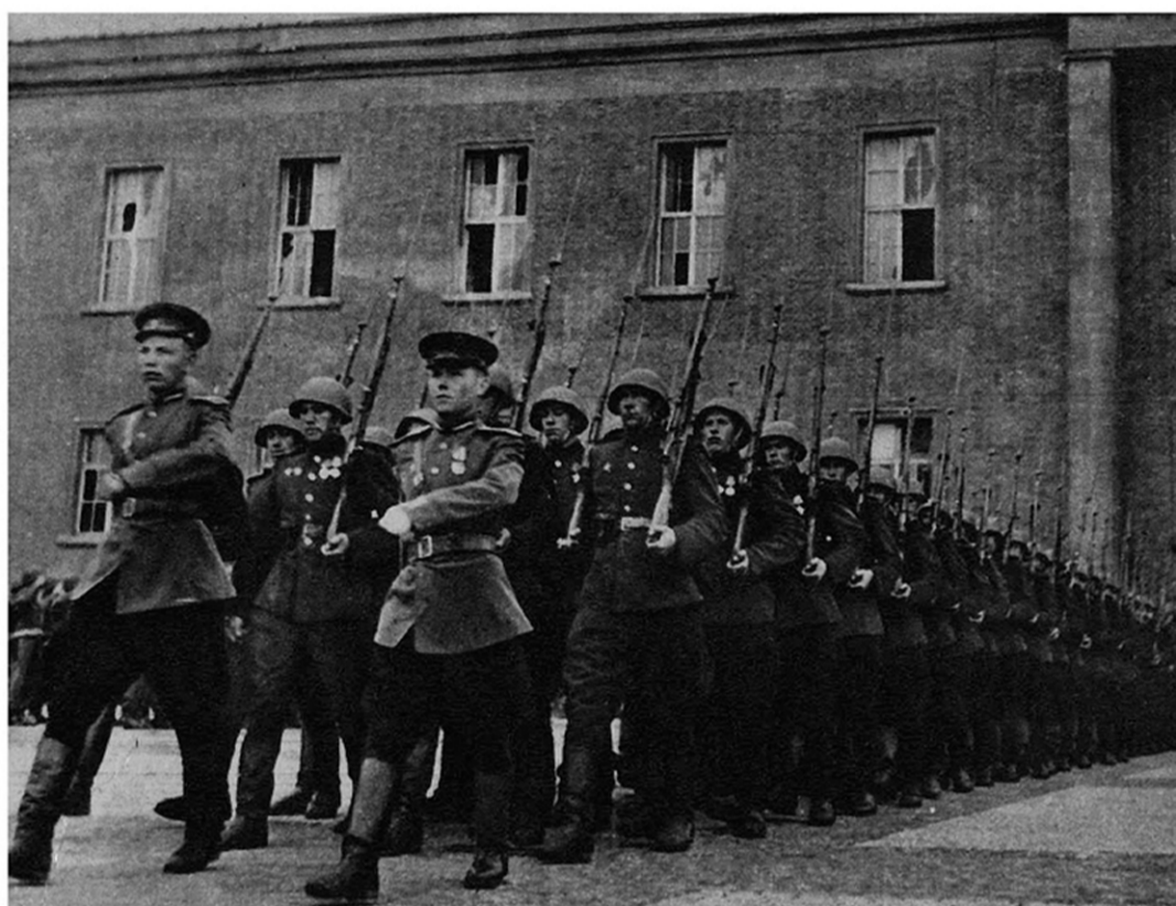
The veteran troops of the Red Army's occupational Berlin Guard parade in front of the Adolf Hitler SS barracks.