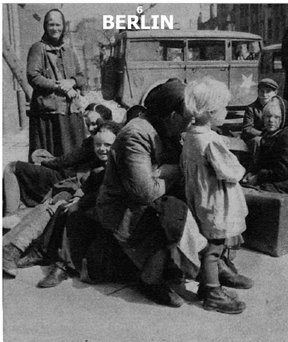
These refugees from the German provinces wait for non-existent transportation to return to their native farms.