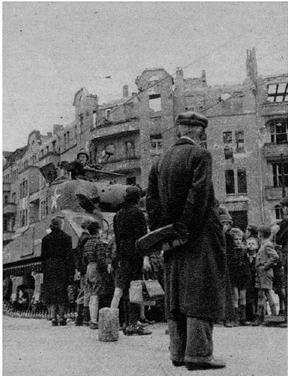
A tank of the Second Armored Division is inspected by the curious citizens of Berlin as a symbol of their defeat.

The Russian soldiers still seem to have a supply of vodka while American GIs are quite dry. A single glass of vodka drunk Russian-style and the whole world has a magnificent old rose hue and language difficulties present no barriers at all to friendship.