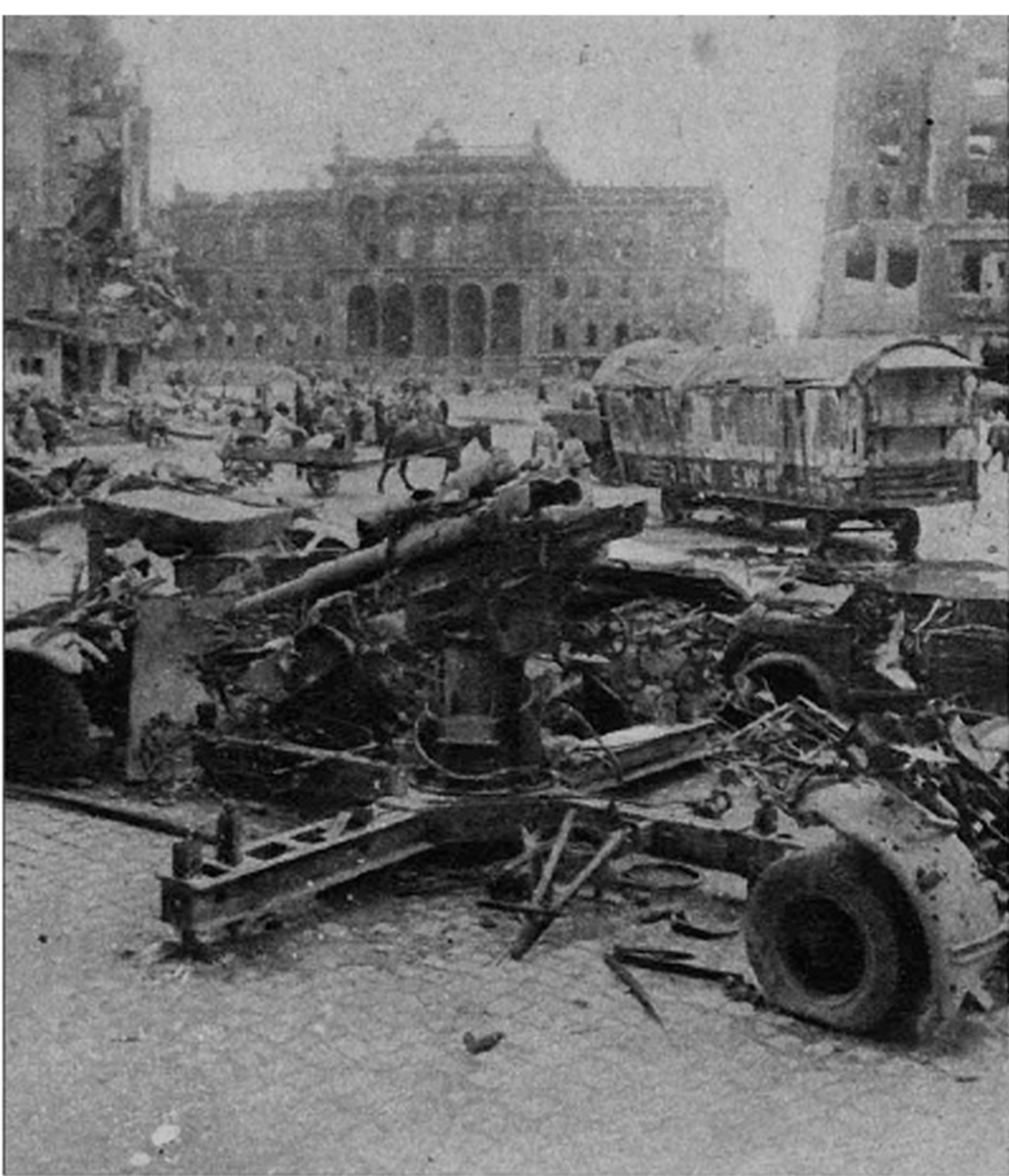
A destroyed German AA gun is left untouched in the heart of Potsdamer Platz, once one of the show places of the city.

"They must be told the entire story of the suffering and death they have made throughout the world. They must have their noses rubbed in the stink of Dachau and in the stink of the German nation under the Nazis. And perhaps it would be well to preserve some of the ruin of Berlin so that they will never forget it."