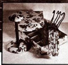
THE ORDER becomes easy randeur Product closet ries in the red apple print.