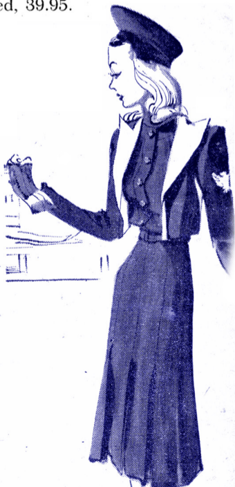
(D) Bloomingdale's, 16.95

In tune with the naval-military trend, as well as the developing fashion for capes, is an officer's cape advertised by Best's, of wool flannel with velvet collar and gold braid trim, for North or South, and "right" over suits or evening gowns. Lined in blue or red, 39.95.