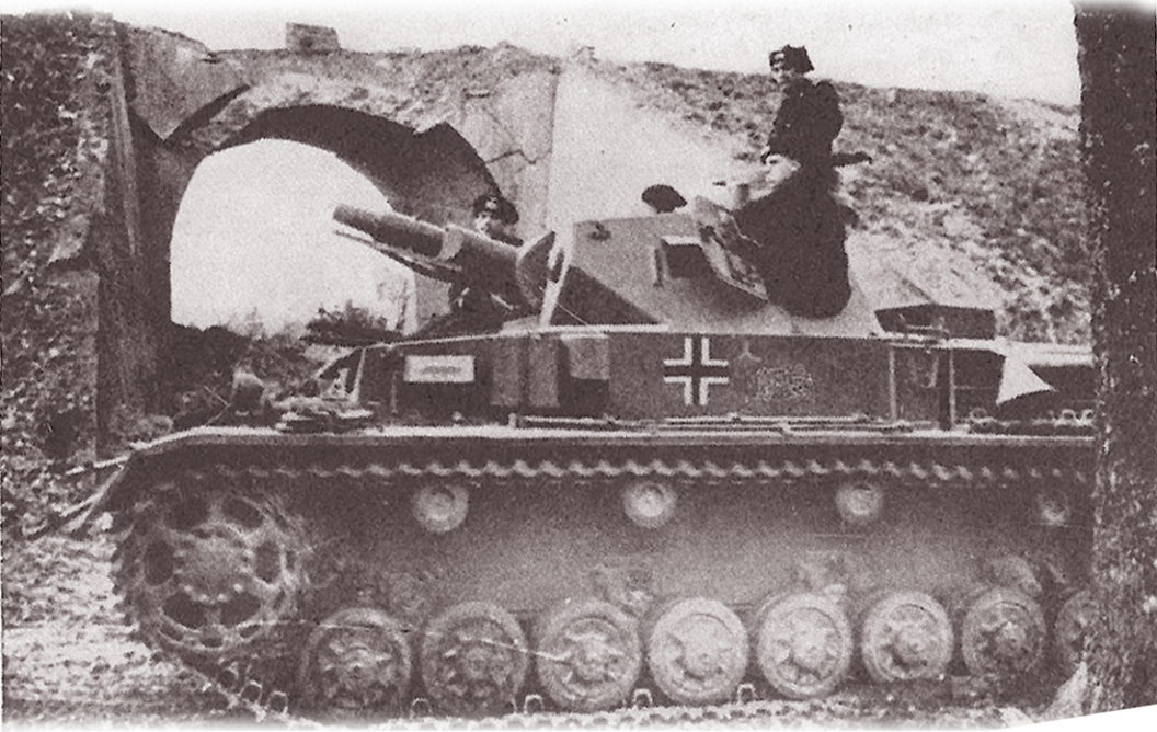
A German tank "Somewhere in Belgium" detours around a dynamitted road.

"I am in the reserve—guard duty. In case of a big battle I might be in it on the front line again. But the youngsters think we old fellows are back numbers. We had no Maginot Line. The youngsters are bored by marking time. I'm not. I know what real war is. I pray they may never know."