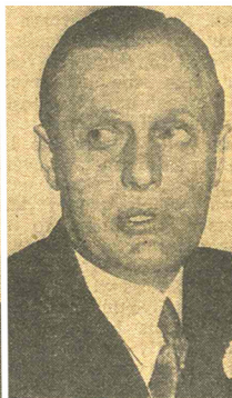
Ickes Struck at the Nazis . . . Welles Rejected a Protest . . . Thomsen Got an Oral Thwack

After several days of consultation between Hitler and his aides, the German foreign office announced that although Welles's words had "left a sting behind," the Reich considered the "Ickes incident" as "officially closed." Washington, however, proceeded to put teeth in its tough foreign policy by a perceptible speeding up of American defense plans.