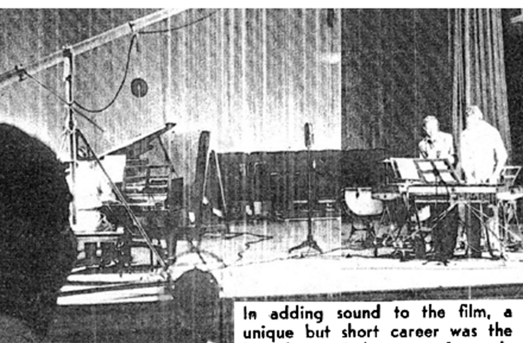
In adding sound to the film, a unique but short career was the lot of a varied group of people

For the hollow wishing-well sequence, which, by the way, was one of the last scenes filmed, though it came at the first of the picture, the echos were recorded, played through a speaker into an empty room and then re-recorded. All that to get the right effect. When the magic mirror spoke, his eerie voice actually traveled through a long tube, then shattered against a marble slab on which lay the microphone.