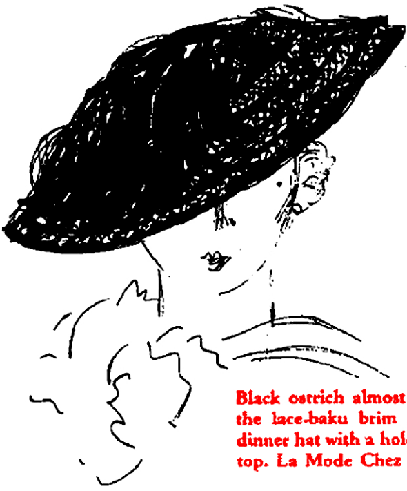
Black ostrich almost covers the lace-trimmed brim of this dinner hat with a hole in the top. La Mode Chez Tappé.

shirtwaist dress principle—turned-over collar, short cuffed sleeves, and buttons up the front.