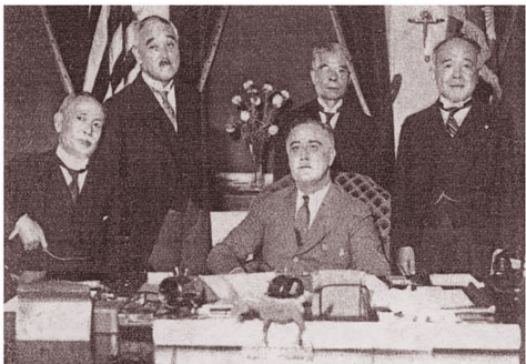
For "World Peace and Prosperity"