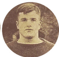
Rodgers, West Virginia.