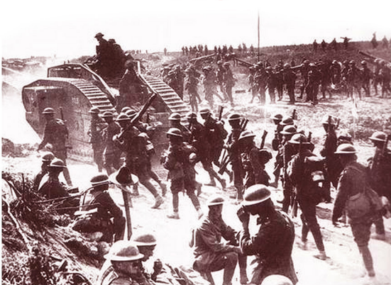
Early in November, the Allied troops were routing a demoralized enemy. America forgot illness, forgot masks, for the War was ending and the influenza epidemic was ending too

In Boston and Washington the public schools were closed. The New York Public Library discontinued the circulation of books. The New York Telephone Company, with no less than 1600 of its operators ill, asked its subscribers not to use the telephone except for the most urgent calls. Dr. Royal S. Copeland, now Senator from New York but then Health Commissioner of New York City, asked business houses to stagger their hours of opening and closing so as to relieve the congestion in the subways and other transit lines. A political campaign was under way, but political meetings were few. In Seattle and many other cities, every place of public assembly was closed. Even war plans were delayed: the Provost Marshal General canceled orders for the entrainment of 142,000 draft registrants because conditions in the training camps were already so appalling.