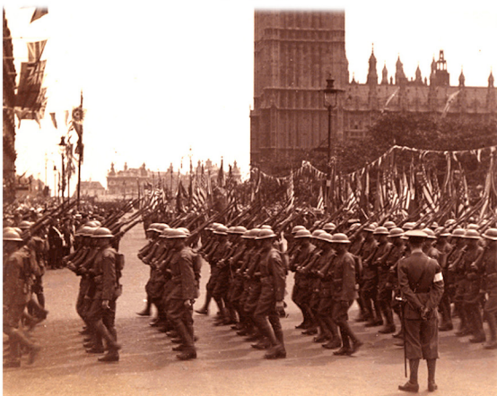
Influenza ran wildly through Europe, for soldiers had to be shifted, and as they marched, the flu marched with them

the Italian Navy. By June it had taken hold in Germany, Austria, Norway, and India. It was running wildly through Europe, and no wonder, for most of Europe was fighting, and troop trains and ships were constantly transporting men hither and yon in quantity. Spain had a hard time with it toward the end of May; hence the name "Spanish influenza" which became attached to it. And as it spread it increased in virulence. During those summer weeks of 1918, when Ludendorff's final thrusts into French territory were being turned back at Château Thierry and Compiègne and Hazebrouck, and Foch was beginning the counterattack which never stopped for long until the War was over, few Americans heard much about the influenza epidemic, but it was moving fast and taking an increasing toll abroad.