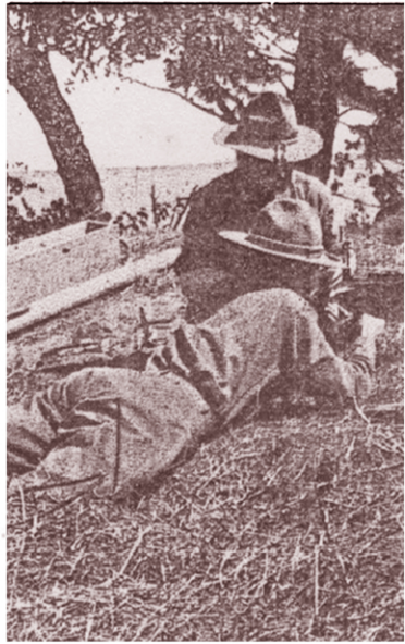
With a machine gun in ambush two men learn to do the work that Grant assigned to a company