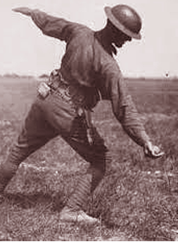
Long practice is necessary for proper grenade throwing

position, under diametrically opposed conditions, yet each struck the popular chord felt by us all at the appropriate time, but so far