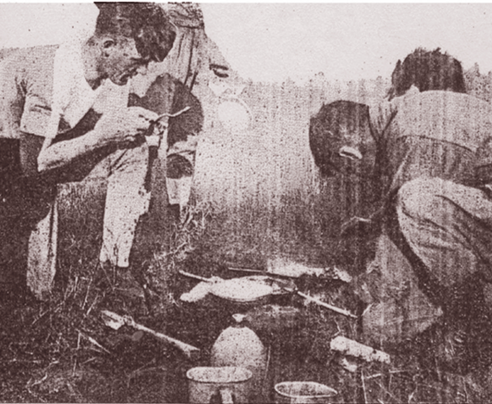
Cooking and cleaning up are not omitted