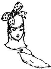
When Summer Zephyrs Grow Boisterous.

As a final word, have you seen the new "Avenue" bags? They are of silk or chiffon or, if you please, they will be made to order to match your gown. They are netted, or, if to go with a tailored suit, it may be they are braid or leather-trimmed. In any case they are intended to look a feature of the costume rather than an afterthought.