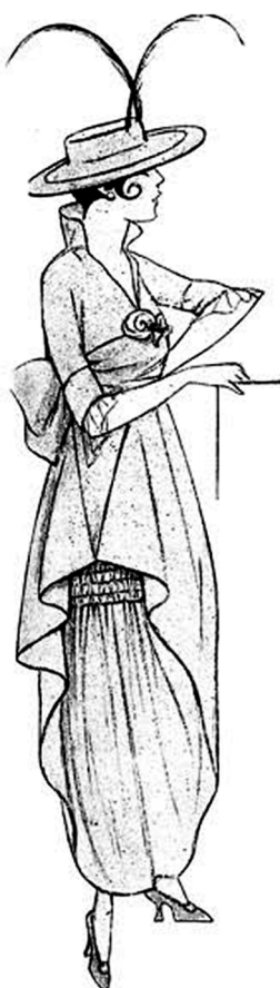
A Longchamp frock was tucked eleven times over