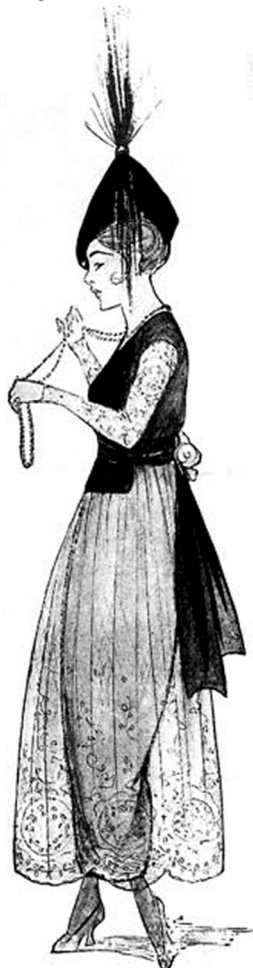
To the Café Madrid came an aristocratic peasant girl in lace and velvet

Redfern prefers to use a double frill on his summer models, and this is very youthful and effective, as was demonstrated by the gown worn by a young girl at the races. In this feature is combined the idea of long tunic and full skirt, which practically sum up the season's styles as far as skirts are concerned. The Redfern dress in question was of white and yellow linen, with a double plissé frill of white linen edged with white chenille, the waist being encircled by a wide, draped sash of the yellow velvet.