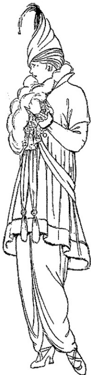
A white velours de laine coat and skirt with a sheer bodice which is suitable for Thé Dansant

Under this gauzy and illusive panier was a semi-tight crushed girdle of figured taffeta, the figures being alternate bands of blue matching the blue at the bottom of the skirt, and soft pink roses. The panier was quite short in front and dropped to the knees at the side. The bodice had an illusive effect caused by the blue ribbon and figured taffeta being veiled with white tulle, edged with a band of rhinestones, and again veiled with a film of the brown net that fell to the waistline, where it was finished with a band