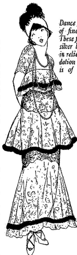
Dance gown of deep, shaped frills of fine lace edged with bison. These frills are held by bands of silver lace insertion embroidered in relief and posed upon a foundation of black satin. The bodice is of the silver lace insertion