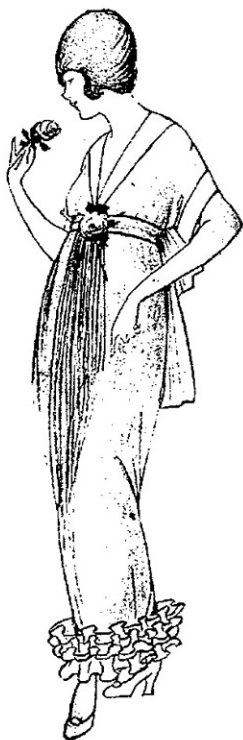
A Cheruit dance frock of blue satin trimmed in rose satin. The fulness of the skirt is placed in small plaits, both in the front and at the back of the skirt. The sash, at the back, is of blue tulle

The dress was severe, but its charm was not so much due to the model, as to the lovely coloring, the blue, which was again repeated in both her stockings and slippers.