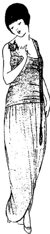
This frock of all blue chiffon is quite sleeveless, and is held on the shoulders with jeweled straps of chiffon. The bodice is nothing more than an elongated girdle. Floating lengths of lavender chiffon fall from the left shoulder