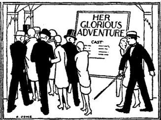
NOW THEY HURRY IN.