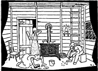
IN THE "ART" THEATRE.