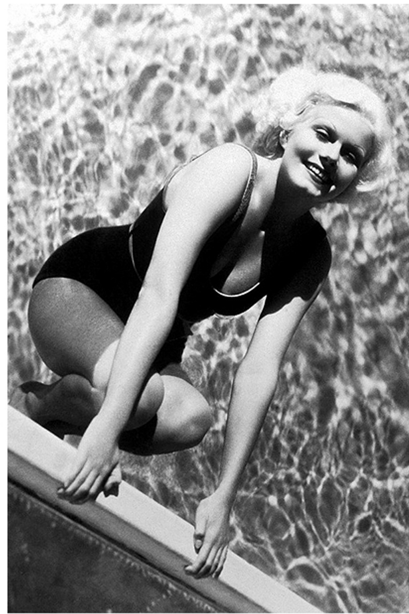
Miss Harlow keeps stream-lined by swimming

The girl with the piquant face, a movie star in the making, watched the studio physical director apprehensively. Her short gymnasium trunks and pull-over sweater revealed her figure as undeniably plumpish in spots.