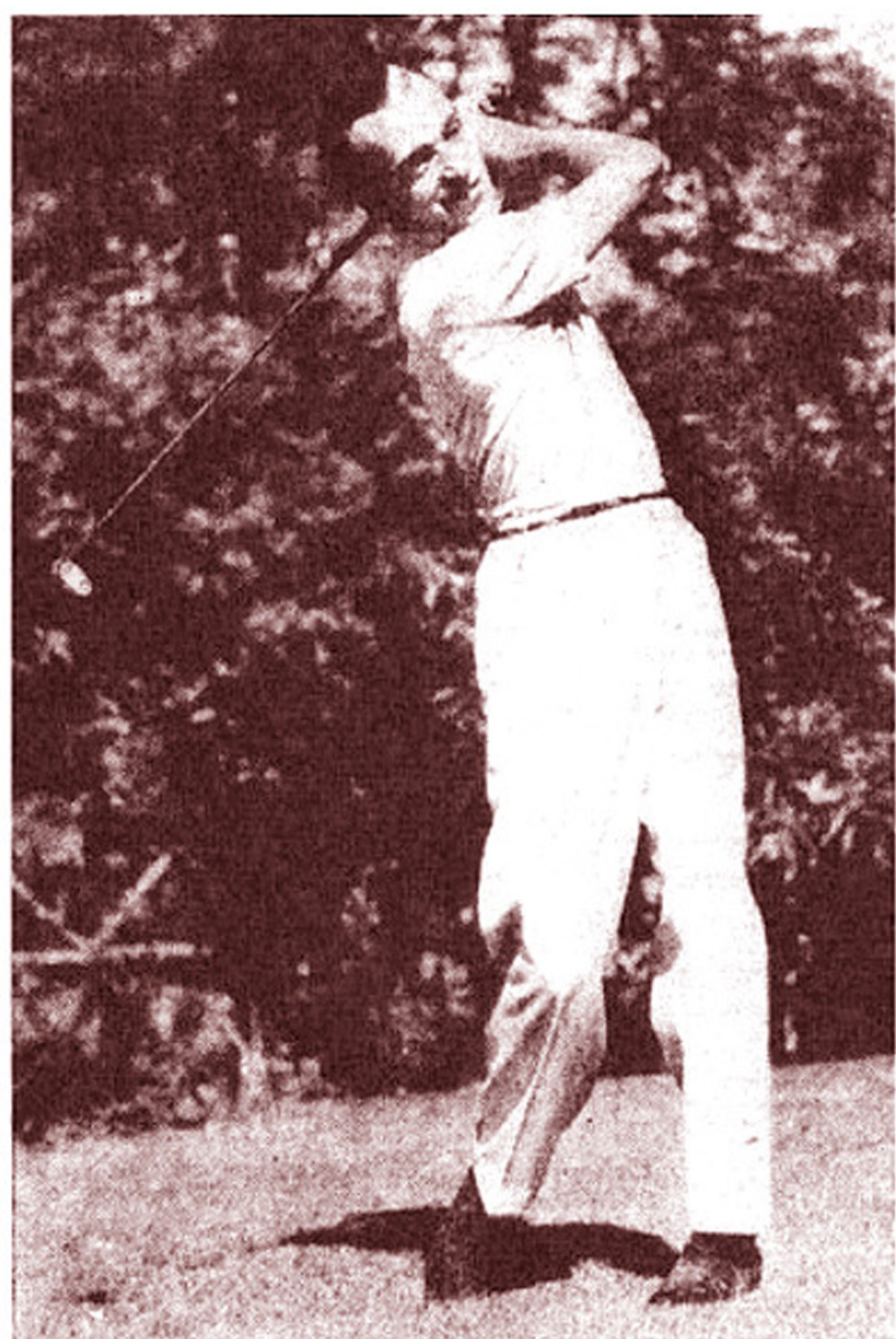
Fred Astaire takes to golf and stays limber

Altho most of the studios have built elaborately equipped gymnasias right on the lot—Warner Brothers, Metro-Goldwyn-Mayer and Paramount are conspicuous examples—no cinema actor, no director or executive patronizes them because it is so nominated in the bond.