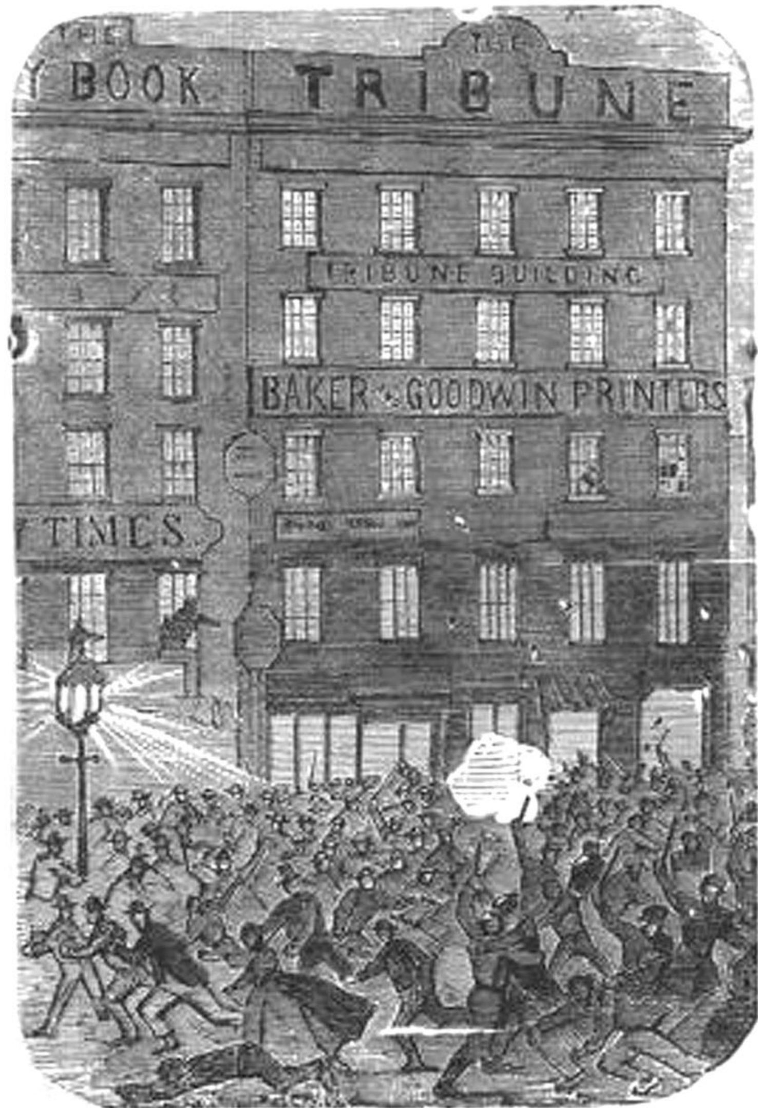
NEW YORK—THE ATTACK ON THE TRIBUNE BUILDING.