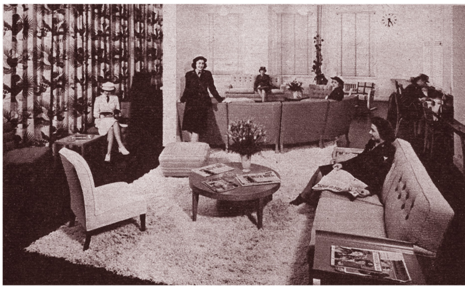
WAVES AND WAACS LUXURIATE IN FRILLY FEMININE LOUNGE ROOM.