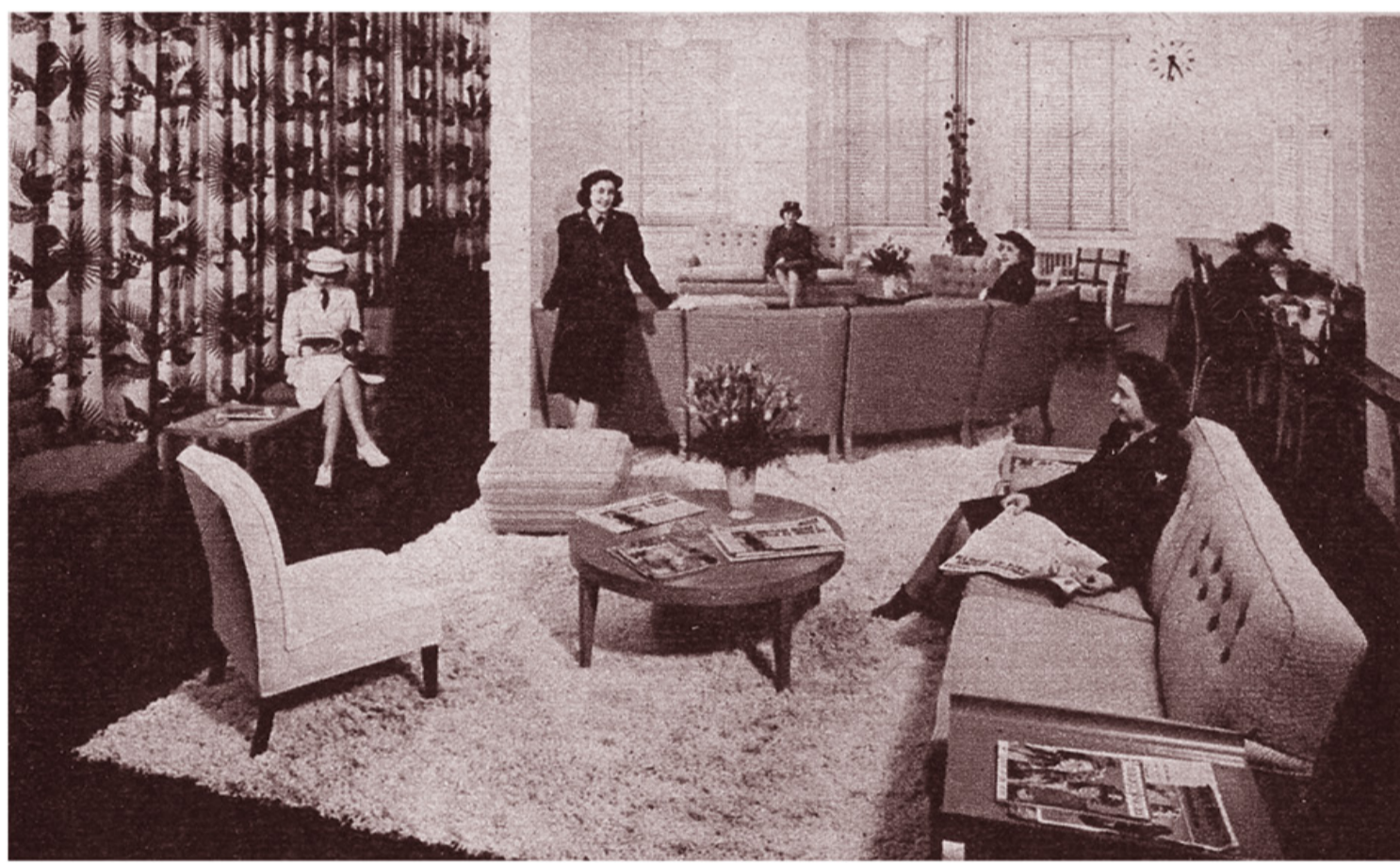
WAVES AND WAACS LUXURIATE IN FRILLY FEMINE LOUNGE ROOM.