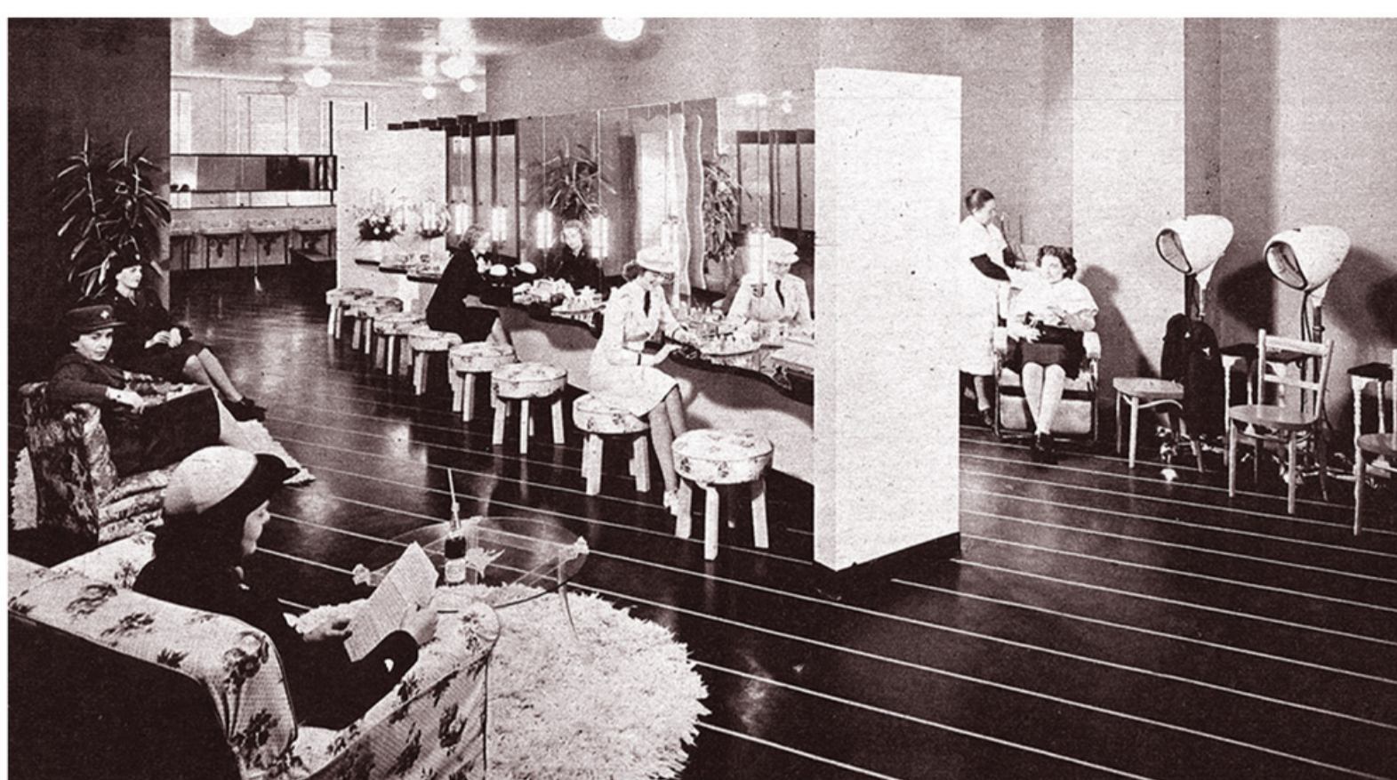
MOST POPULAR SPOT IN SAN FRANCISCO WOMAN'S SECTION OF THE CENTER IS THE BEAUTY PARLOR AND THE MAKE-UP BAR

Movie splendor is now provided for Waacs and Waves in big new canteen