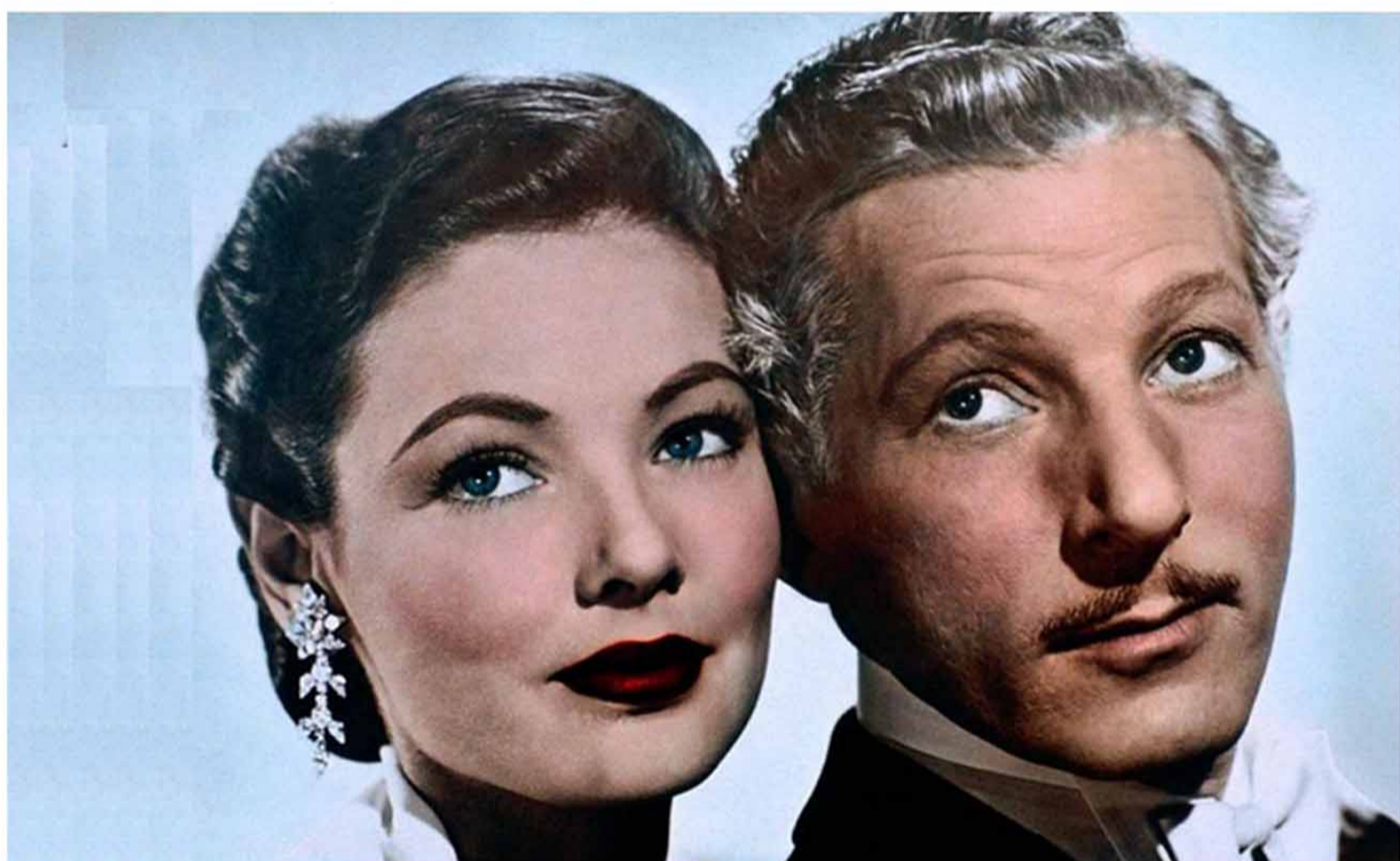
Gene Tierney and Danny Kaye moved from Brooklyn to Hollywood.

Just 75 years after Thomas Edison invented the phonograph, sales by the phonograph record industry reached the huge total of 175 million records a year. Paying tribute to this last week, Variety dubbed records the "new king of Tin Pan Alley," while Billboard called the past 10 years "The Record Decade. . . . In the 10-year period, records created more stars than radio, TV or motion pictures."